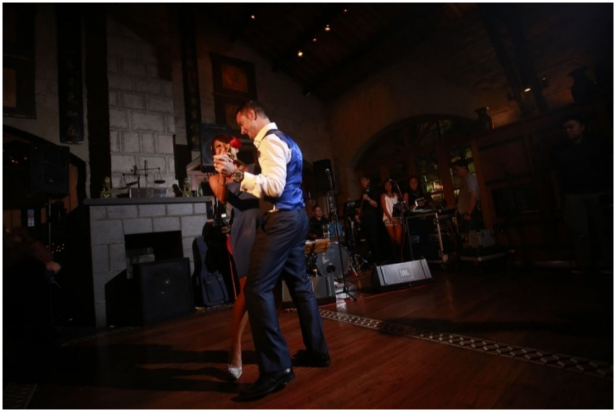
Wedding Planner: Bliss Creations Venue: The Peak Lookout