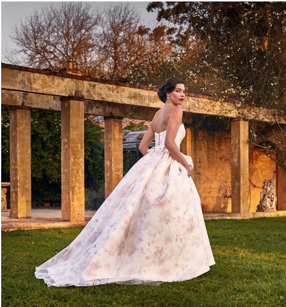
Paddington Weddings , Bertossi Brides Collection 2017