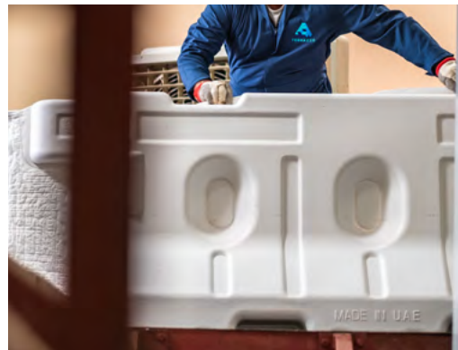
POLYTEX® ROAD BARRIER

We also trade in prime and non-prime Borouge® polymer – a raw material that is used in the automotive, electronics, building, and construction industries.