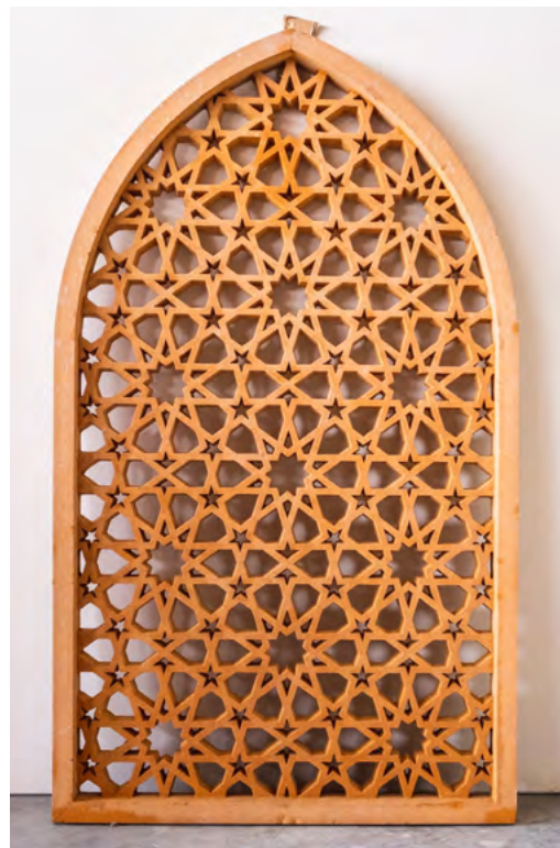
▲ GRC SCREEN WITH AN ACID ETCHED FINISH