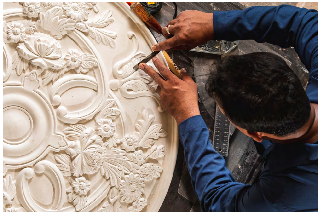
▲ CARVING OF A DECORATIVE GRC PANEL