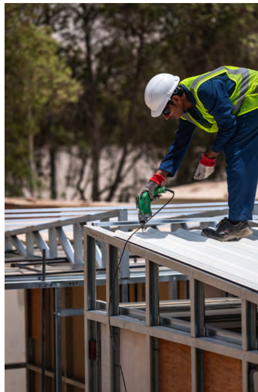
ROOF INSTALLATION IN PROGRESS

AN OPERATOR USES OUR CNC COLD ROLL STEEL MACHINE