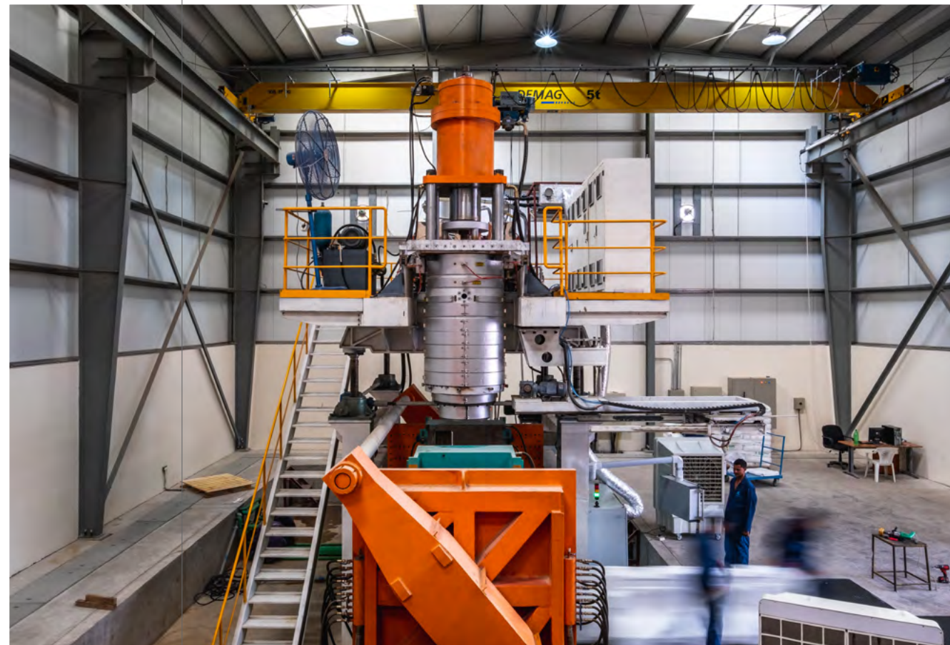
OUR BLOW-MOLDING FACILITY

DELIVERING OPTIMAL STORAGE, LOGISTICS, AND INFRASTRUCTURAL SOLUTIONS