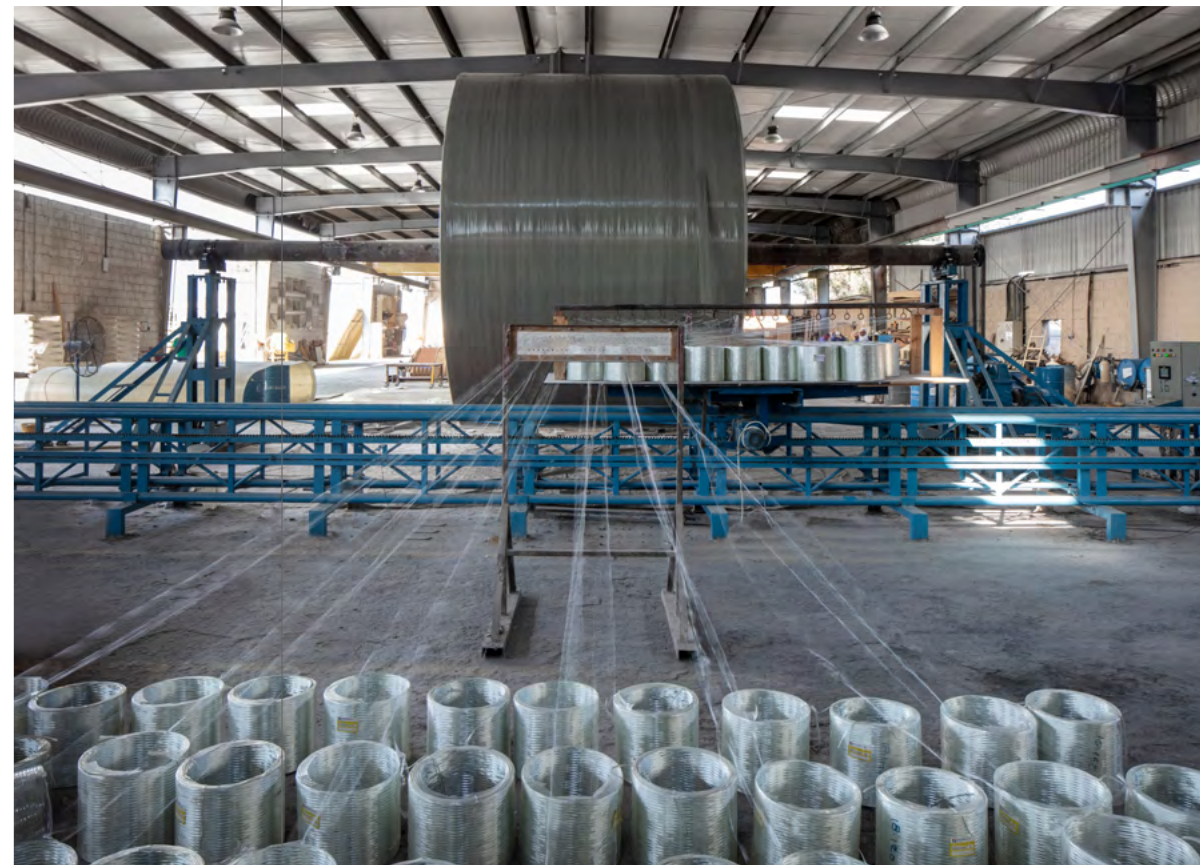
ON-GOING FILAMENT WINDING PRODUCTION

These unique characteristics make GRP suitable for a wide range of applications such as enclosures, concreting molds, sewerage, domes and pergolas, water storage, louvers, screens, facades, and cladding panels, and many more.