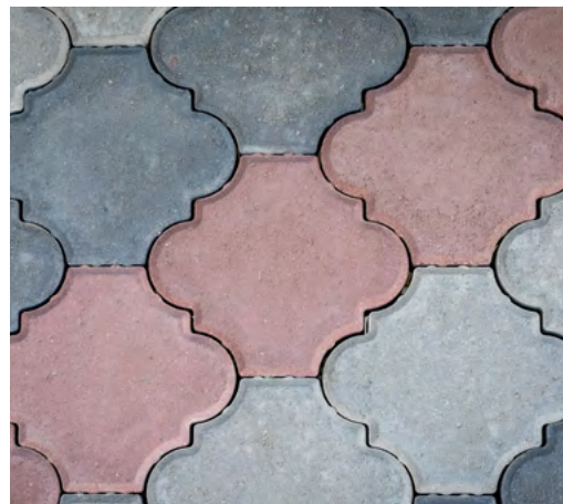
▲ UNIWAVE INTERLOCKING PAVERS

The rapid expansion of the UAE has seen a growing demand for products in this category.