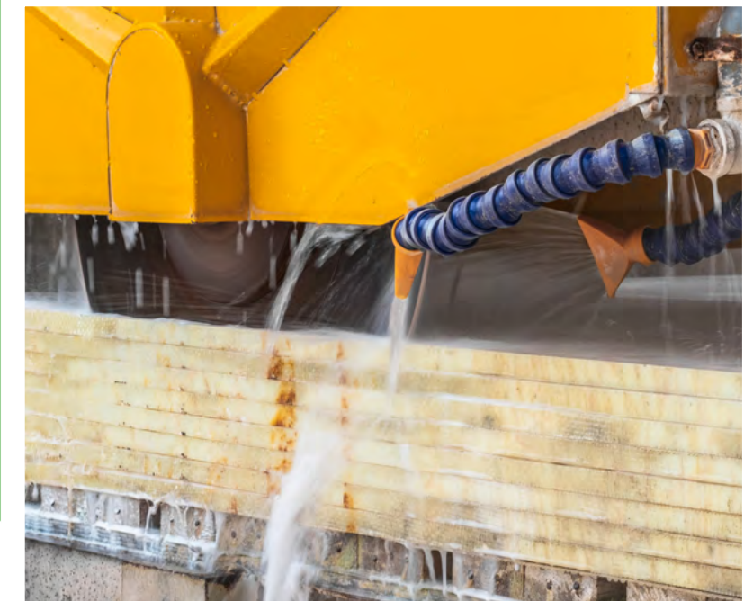
MARBLE SLABS BEING PROCESSED