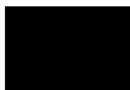
Black noir RAL 9005