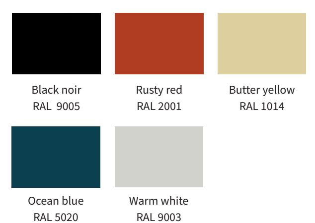
TABLE TOP FINISH