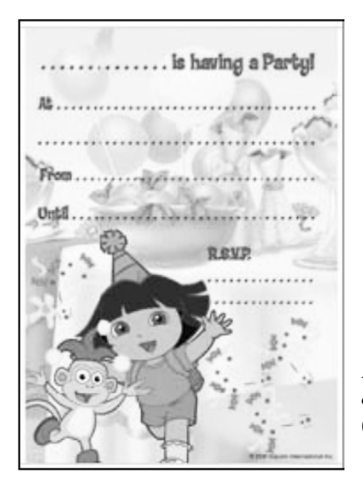
Figure 4: The SENTENCE COMPLETION solution seems quite at home in this prototypical party invitation (making it also a peripheral member of the forms genre).

While patterns can occur within different genres, it may well be the case that many of them have a 'home genre' in which they are an essential feature. For example, the pattern LIST OF INGREDIENTS is an essential feature in its home genre 'recipe book', but it also occurs in the genre 'form' (where users might be given lists of key information to gather before starting).