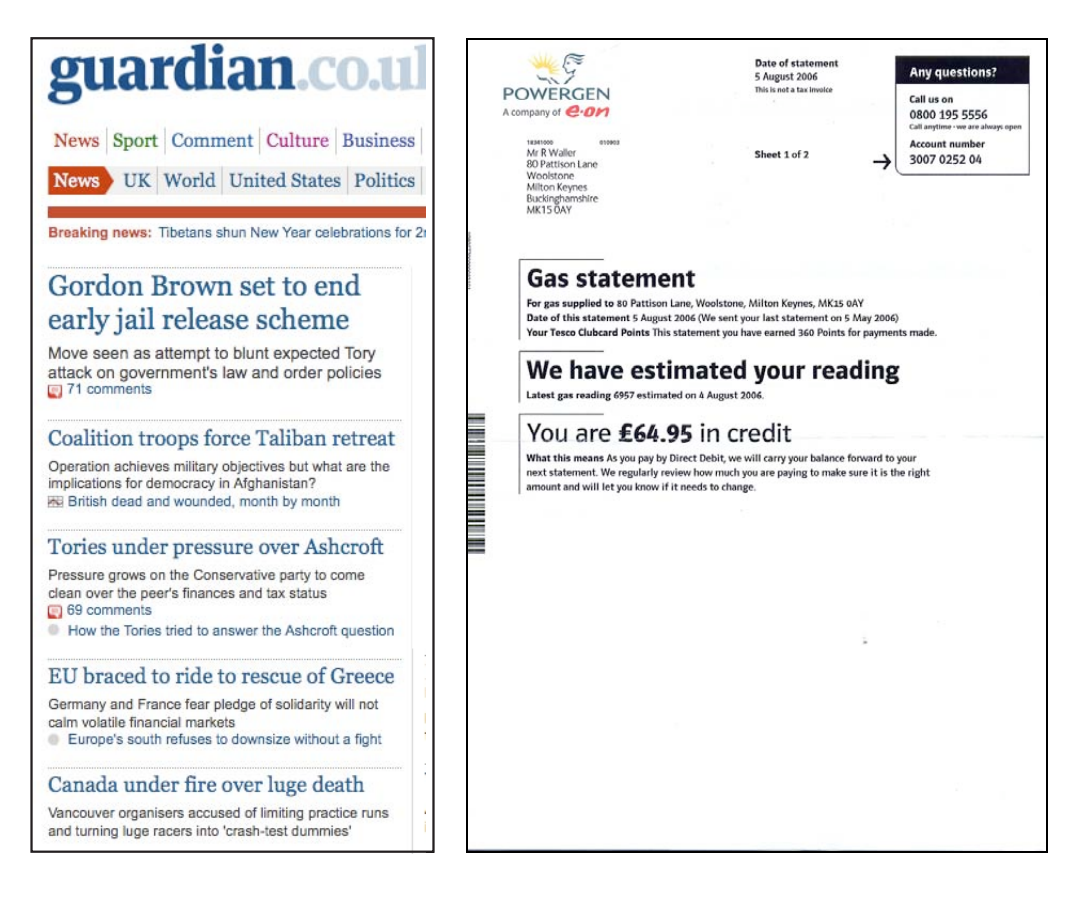
Figure 5: The NEWS HEADLINES pattern in its home genre (left) and in a gas bill (right)

While patterns can occur within different genres, it may well be the case that many of them have a 'home genre' in which they are an essential feature. For example, the pattern LIST OF INGREDIENTS is an essential feature in its home genre 'recipe book', but it also occurs in the genre 'form' (where users might be given lists of key information to gather before starting).