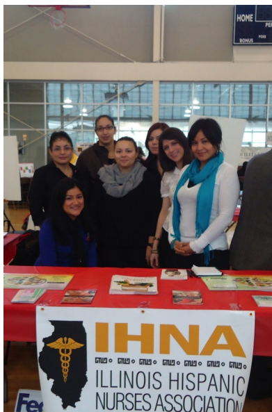
The Illinois Hispanic Nurses providing Diabetes education to families in Cicero.