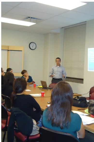
IHNA discussing the mental health needs of the Hispanic community at UIC.