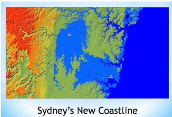
Sydney's New Coastline

Politicians make decisions which expose the public and future generations to grave risks, with the probability that there will be climate change risks exceeding 99.999%.