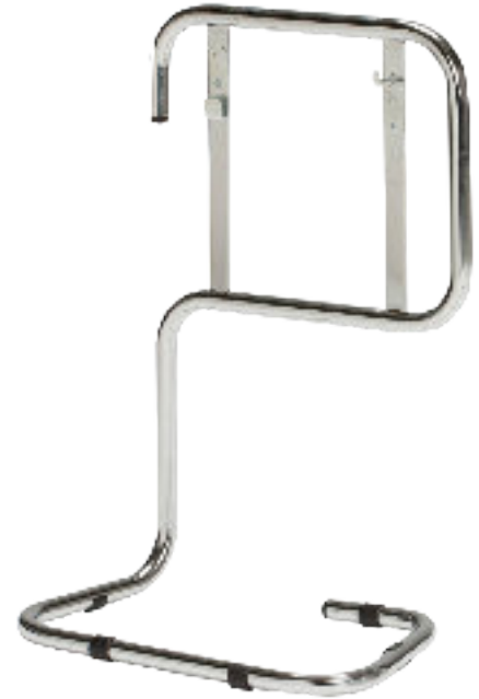
X/CS2 (Double Stand)