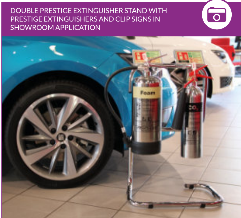
DOUBLE PRESTIGE EXTINGUISHER STAND WITH PRESTIGE EXTINGUISHERS AND CLIP SIGNS IN SHOWROOM APPLICATION