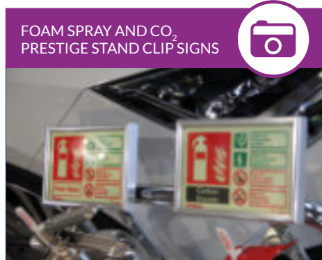
FOAM SPRAY AND CO 2 PRESTIGE STAND CLIP SIGNS