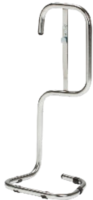
X/CS1 (Single Stand)