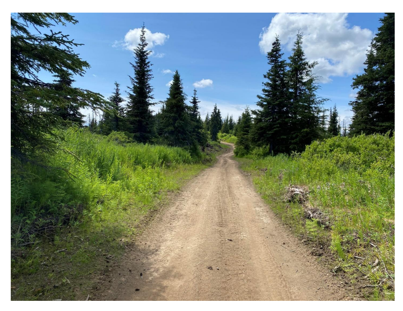
Photo 3: The portion of the Boardwalk Trail between the parking lot and the Moose Creek. This section was partly rehabilitated in 2021.