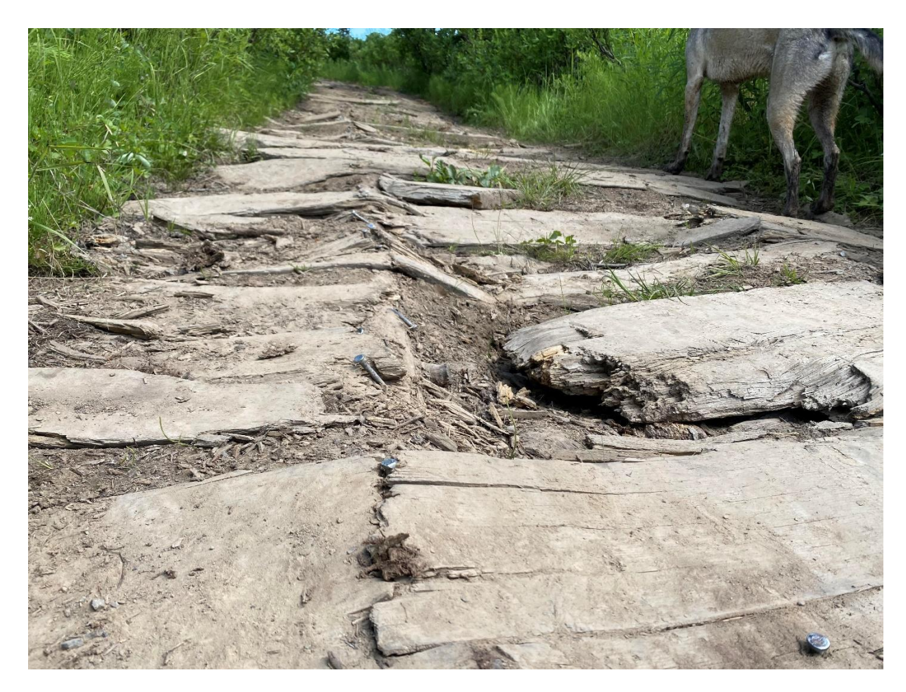
Photo 1: A close-up of the degraded Boardwalk Trail that users avoid. Big nails are sticking up everywhere, which stops both horse riders as well as ATV users. July 2022.