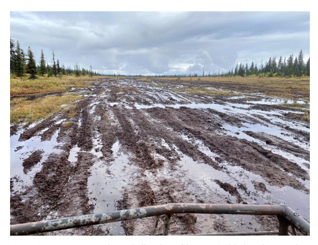
Photo 4: ATV users are not using the Boardwalk Trail east of the Moose Creek bridge and are instead driving out onto the wetland, which has seen severe damage. This photo is from early September in 2022 before the 2022 moose hunting season (the damage increased with all traffic related to moose hunting).