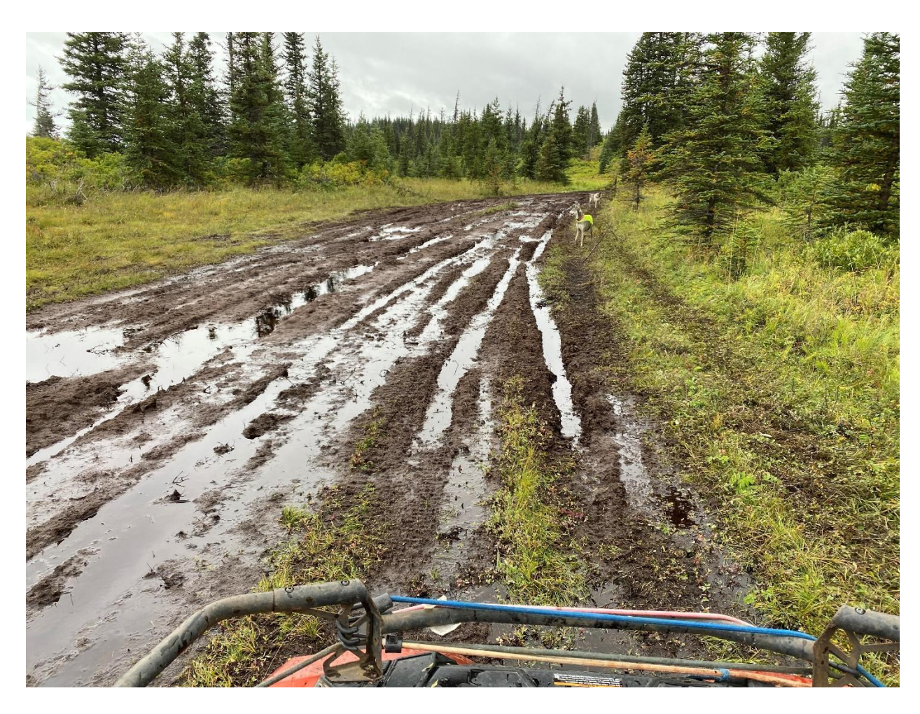
Photo 5: The small valley of Moose Creek in the distance (looking west) and the beginning of the wetland damage caused by ATV drivers abandoning the Boardwalk Trail just east of Moose Creek due to the extremely poor condition of the trail east of the Moose Creek bridge .Photo in early September 2022 prior to the start of the moose hunting season.