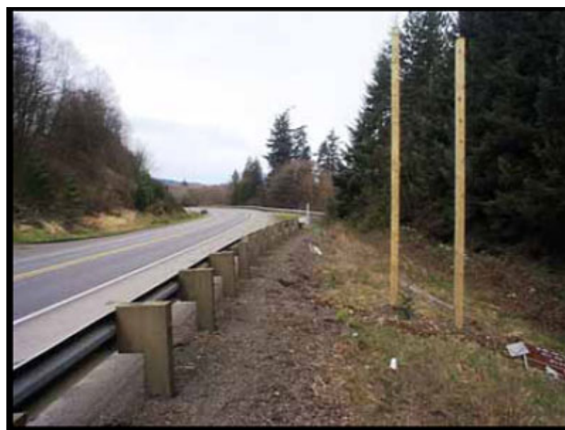
Photo 5. BEFORE – Shows the work zone site during 1st post-incident FACE investigation site visit, prior to fill, rock and gravel being brought in to augment the sign installation. Looking west along the eastbound lane of highway.

Photo 4. Shows the vehicle involved in the incident looking west along the shoulder of the eastbound lane.