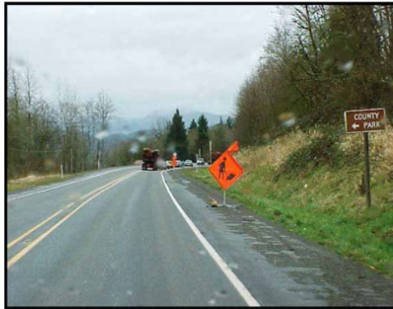
Photo 1. Shows work zone signs traveling eastbound heading toward the incident site which is just beyond the curve on the highway.