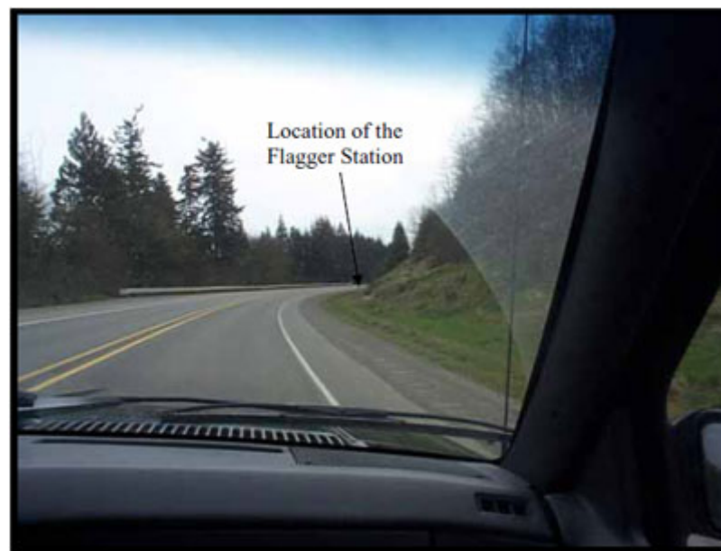
Photo 2. Shows the FACE Investigation vehicle traveling eastbound toward the flagger station and work zone during post incident FACE investigation.