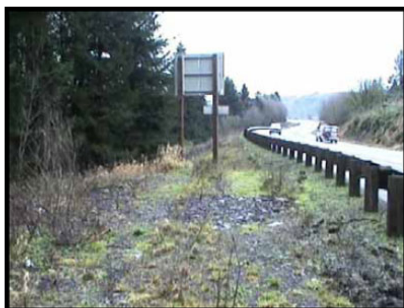
Photo 6. AFTER – Shows the work zone site during 2nd post-incident FACE investigation site visit, and after fill, rock & gravel had been brought in so sign installation could be completed off the roadway without impacting highway traffic. This view is looking east along the westbound lane of highway.

Photo 5. BEFORE – Shows the work zone site during 1st post-incident FACE investigation site visit, prior to fill, rock and gravel being brought in to augment the sign installation. Looking west along the eastbound lane of highway.