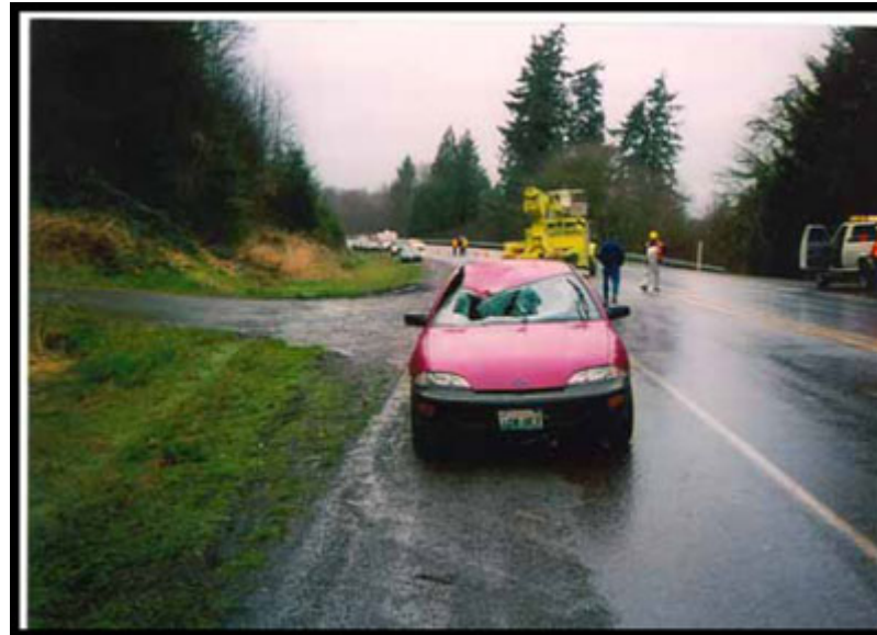
Photo 4. Shows the vehicle involved in the incident looking west along the shoulder of the eastbound lane.

Photo 3. Shows the incident site looking east on the eastbound traffic lane and the shoulder of the highway.