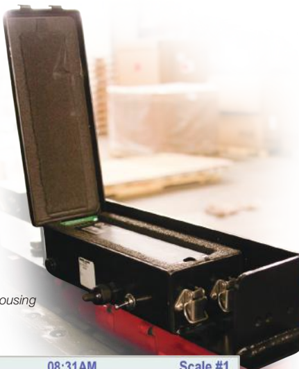
Wireless battery housing

The wired or wireless scale-to-indicator systems are available with either the CLS-920i or the CLS-420.