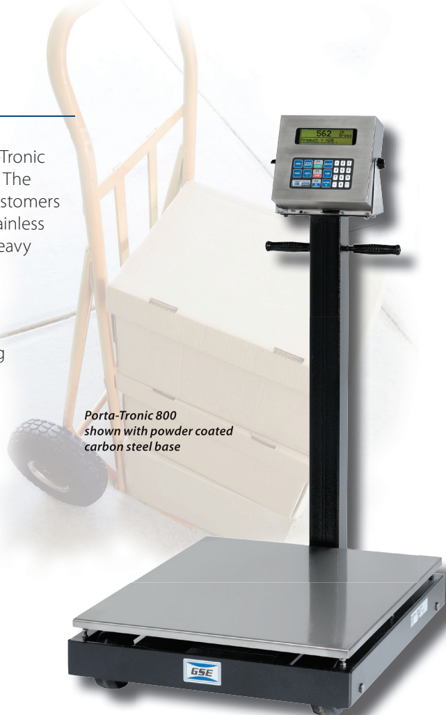
Porta-Tronic 800 shown with powder coated carbon steel base