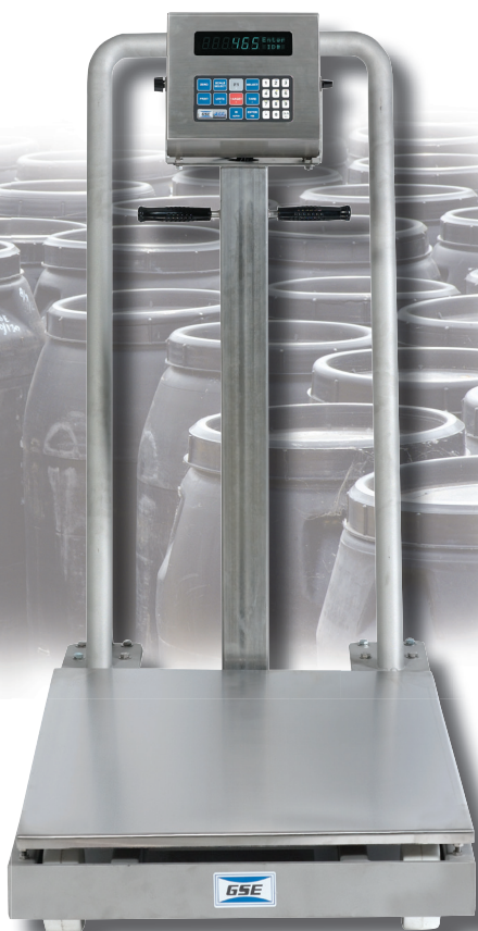
Porta-Tronic 800 shown with stainless steel base

The Porta-Tronic 800 was designed for mobile weighing in light to medium capacity applications. Smooth, portable operation maximizes efficiency when weighing in multiple areas. Numerous options provide flexibility for custom applications.