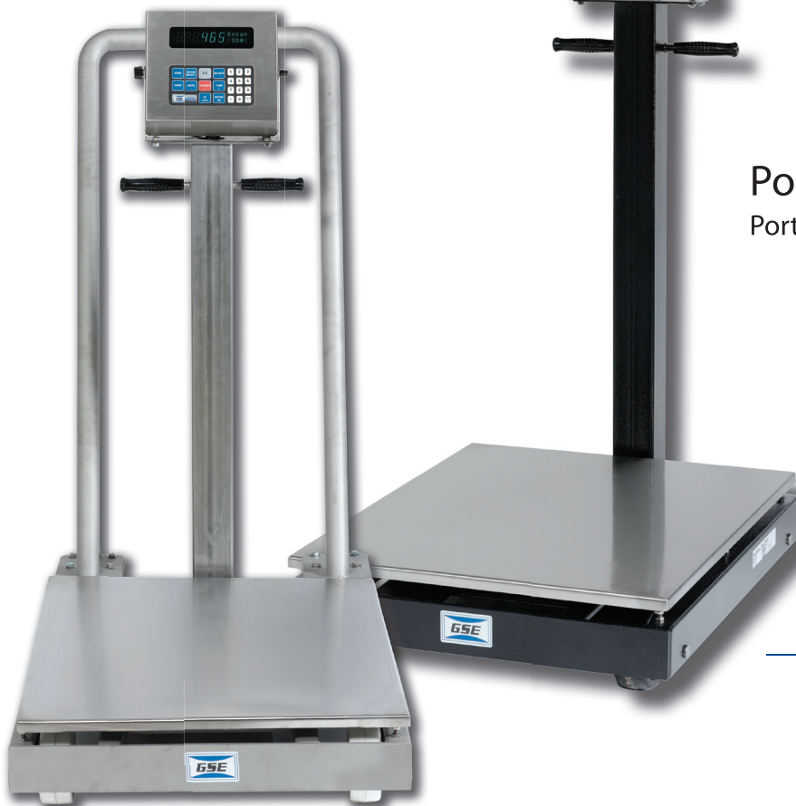
Porta-Tronic 800 Portable Scale