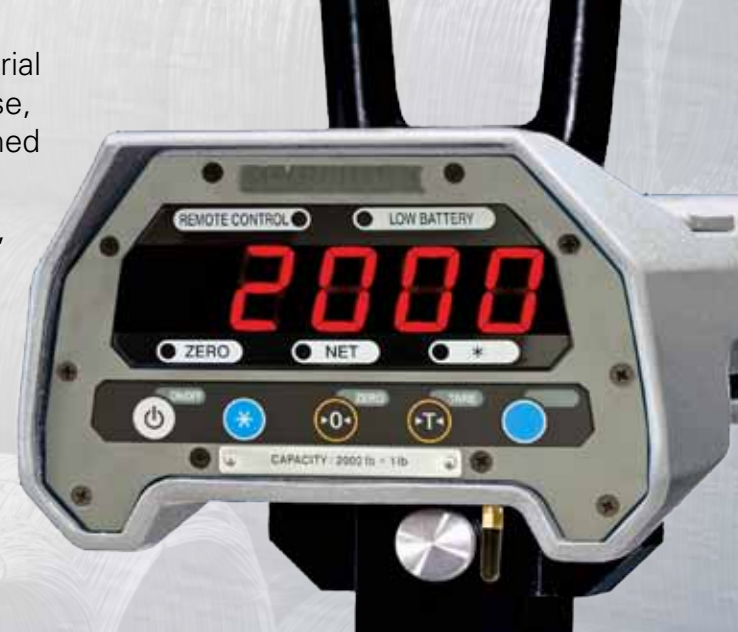
Caston II Plus ▶