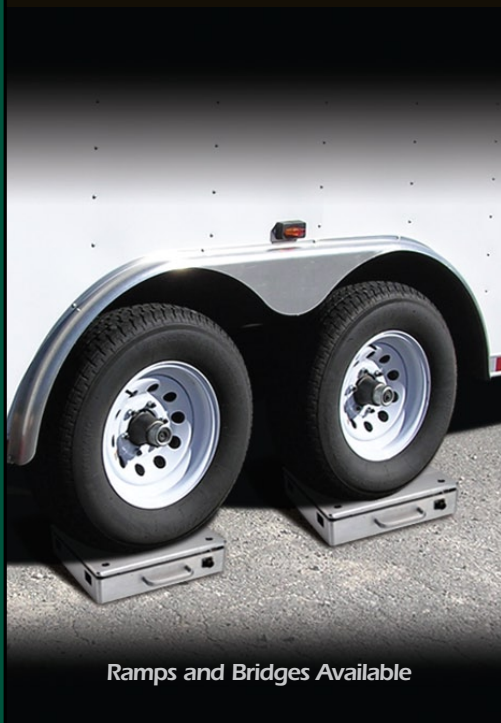
Ramps and Bridges Available

SW™ Scale Systems offer diversity for your most exacting weighing applications. Intercomp's unique SW™ Series Scale Systems provide all the flexibility needed to fine tune weight and balance to varying design criteria.