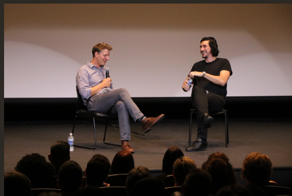
Jeff Nichols & Adam Driver*