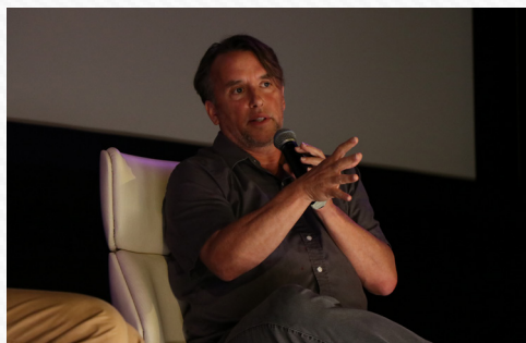
Richard Linklater**, 2018