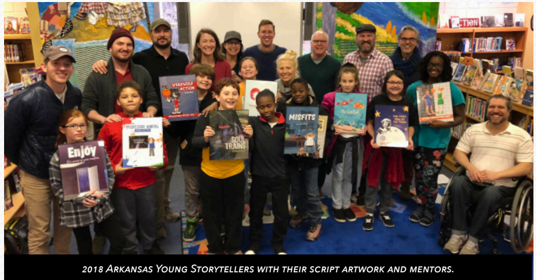
2018 ARKANSAS YOUNG STORYTELLERS WITH THEIR SCRIPT ARTWORK AND MENTORS.