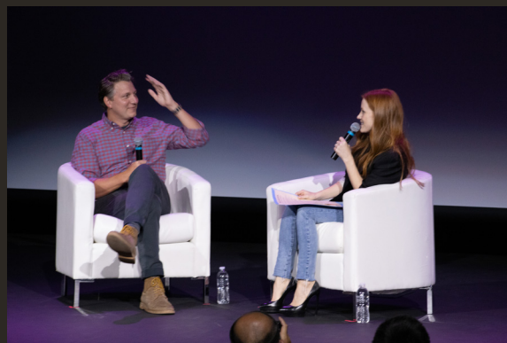
Jeff Nichols & Jessica Chastain*