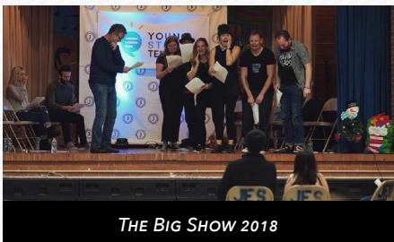
THE BIG SHOW 2018

Every Child Has A Story Worth Telling. Our mission is simple: we inspire young people to discover the power of their voice. Using one-on-one mentorship, public school students learn how to write original stories and see them brought to life. Thanks to volunteer mentors, actors, and classroom teachers, Young Storytellers serve more than 60 public schools in Los Angeles, New York City, San Francisco, Austin, and now ARKANSAS! Reaching thousands of students in elementary, middle, and high school each year.