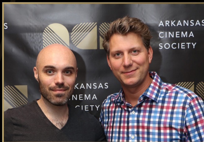
David Lowery and Jeff Nichols