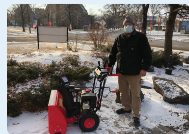
A brand new snowblower for the Mission!