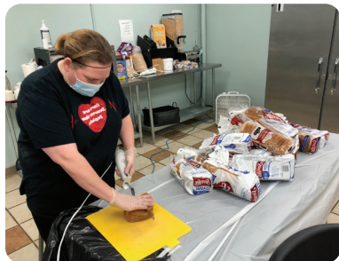
More than 100 loaves of bread were chopped up to make stuffing!