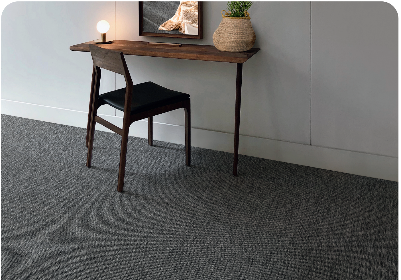
▲ 6300 / 98