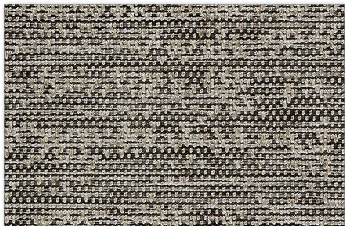
▲ 4035 / 17