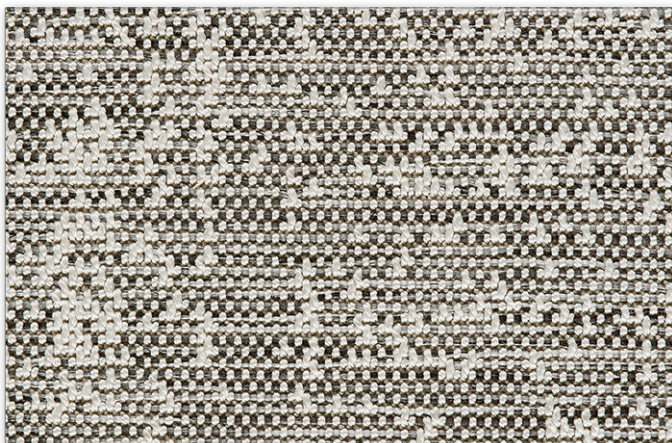
▲ 4035 / 12