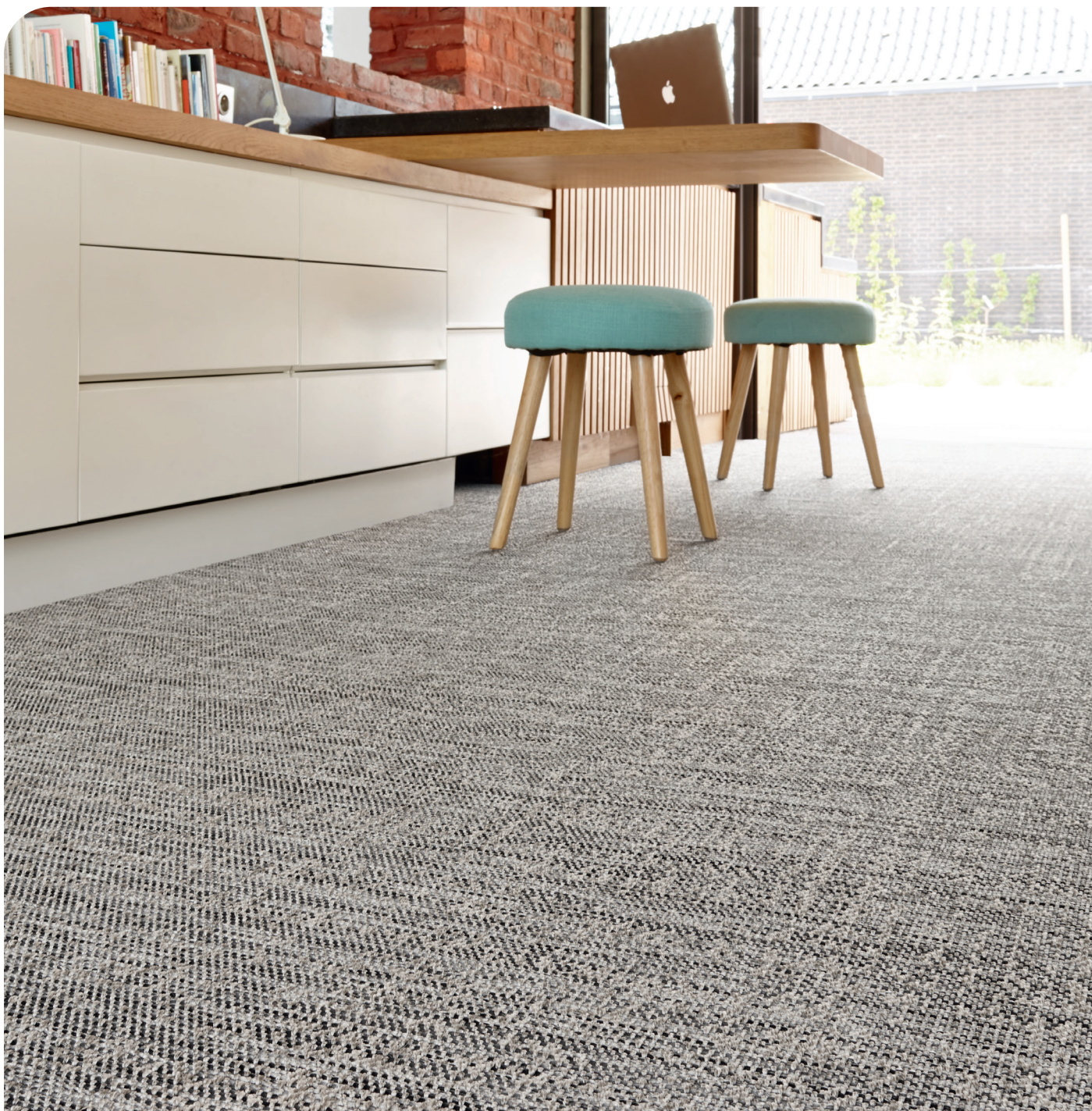
▲ 4035 / 17