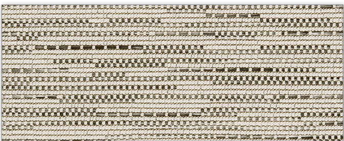
▲ 4001 / 21