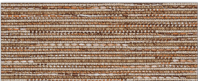
▲ 4001 / 31