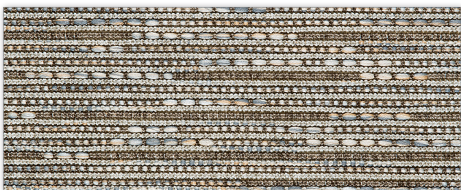
▲ 4001 / 51