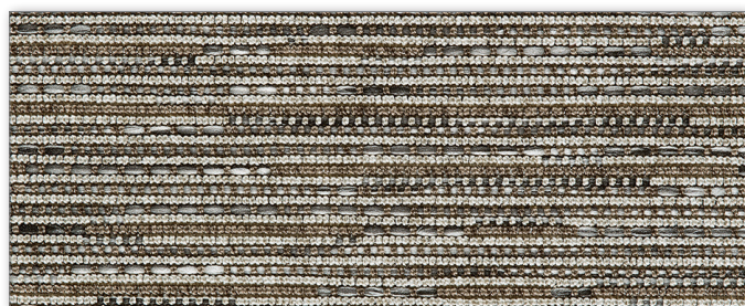
▲ 4001 / 71