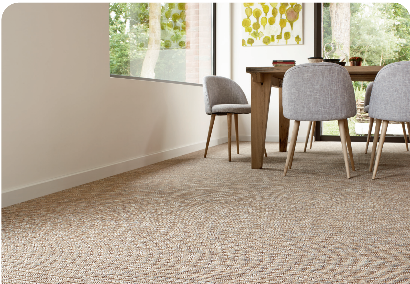
▲ 4001 / 41