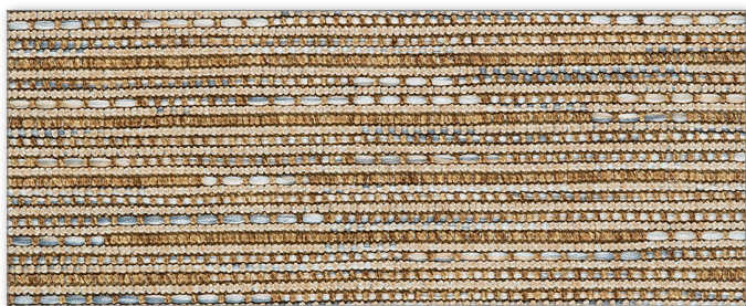
▲ 4001 / 41