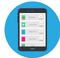
Handshake Mobile Order Writing App