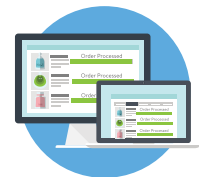
Handshake Order Admin Website