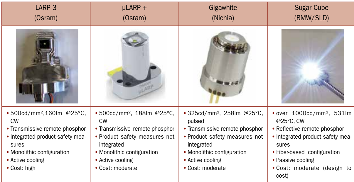
Table 1: Different laser-based white light engines