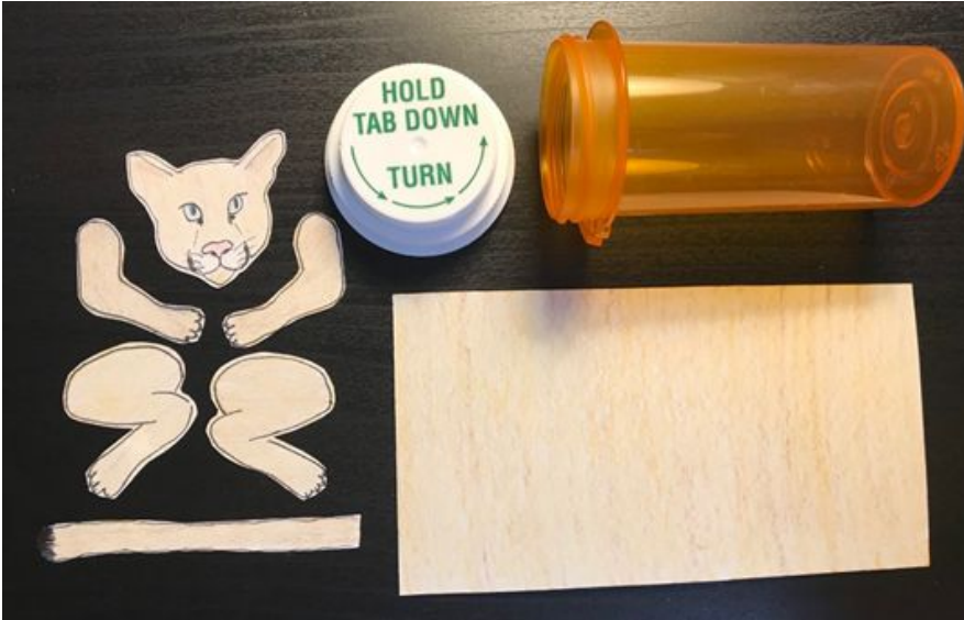
Steps 1 through 4

You're done! Don't forget to bring your collected quarters the next time you visit the Zoo. In the meantime, share your progress on social media and tag @oakzoo or send it directly to us by clicking here .