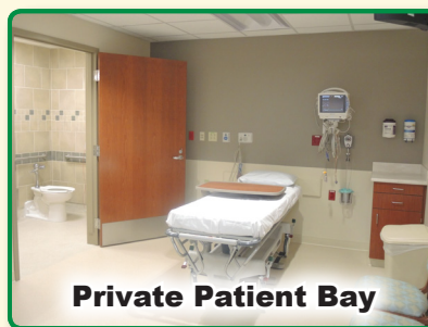
Private Patient Bay