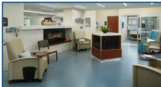
Community Treatment Center