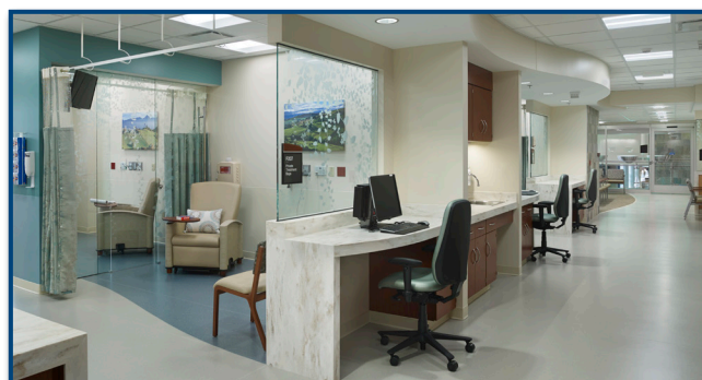
Private Treatment Bays