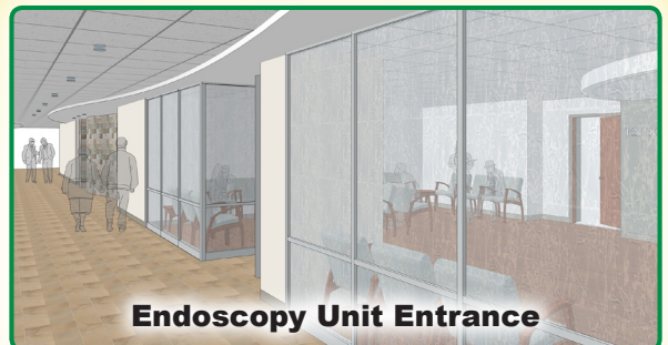
Endoscopy Unit Entrance