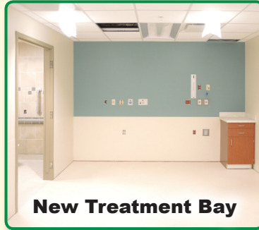
New Treatment Bay