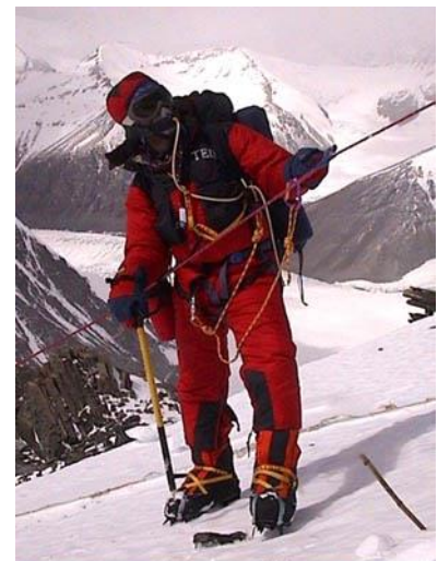
Using Fixed Ropes

Most men simply do not communicate to the same depth when women are present – about either spiritual or emotional issues. Effective men's ministries structure their ministry in a way which allows men some time to talk with other men, without women present.