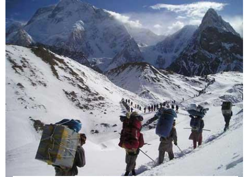
Advancing to the Base Camp