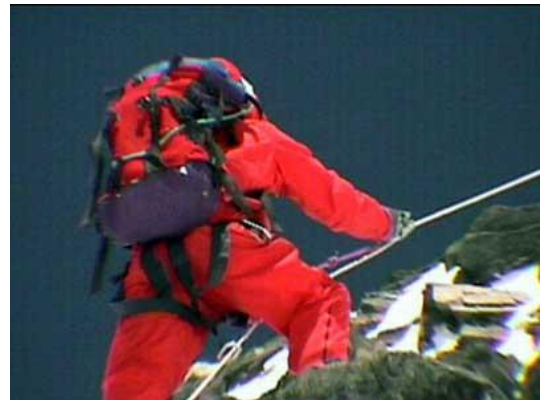
Following Those Who Have Gone Before