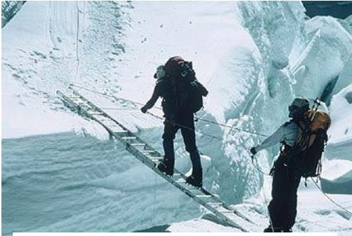
Bridging the Gap

Most men are isolated relationally. They have been taught by their culture to protect themselves by keeping their relationships within certain "safe" parameters. However, the benefits of authentically connecting with other brothers in Christ far outweigh the risks.