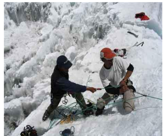
Holding the Ropes

The call for men to lead can be easily misunderstood and misapplied to the detriment of other men and women. But whatever has happened in the past, the church was never intended to tolerate or justify an agenda of male chauvinism or dominance, either intentionally or unwittingly. At the same time, its history is clear – the church has risen to serve its fullest potential only when men rise to serve others, and in turn invest in other men.