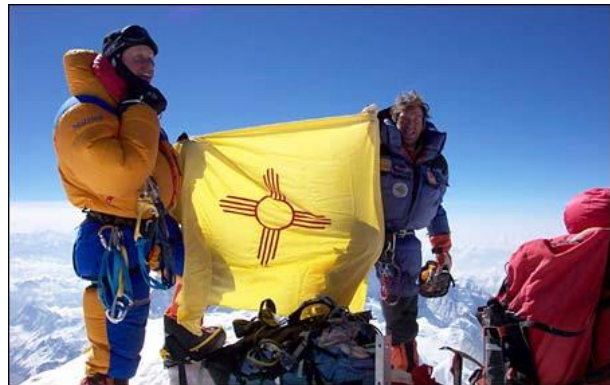
On the Summit