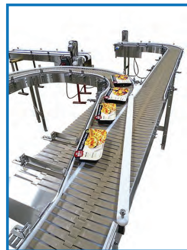
* Tabletop conveyor with side transfer