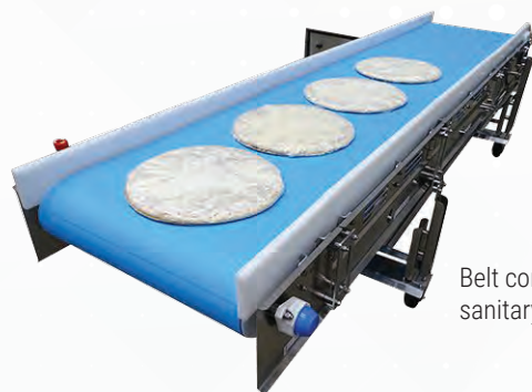
Belt conveyor with sanitary option