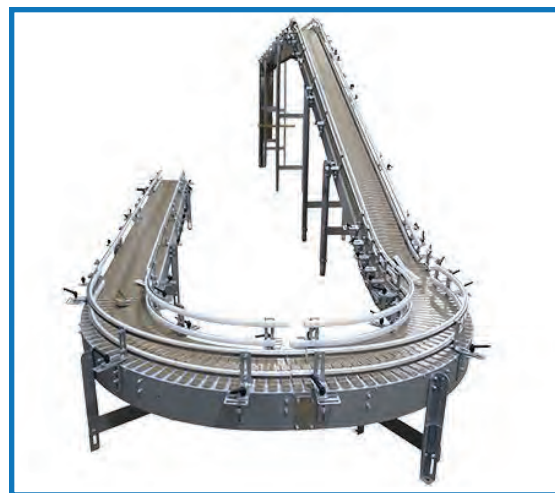
* Tabletop conveyor with double guides