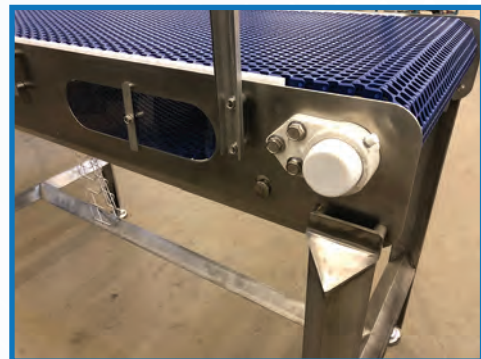
* MatTop conveyor with washdown option