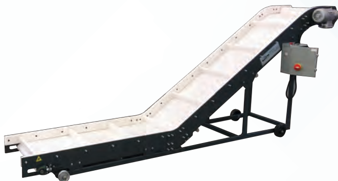
* MatTop Z-Shape conveyor