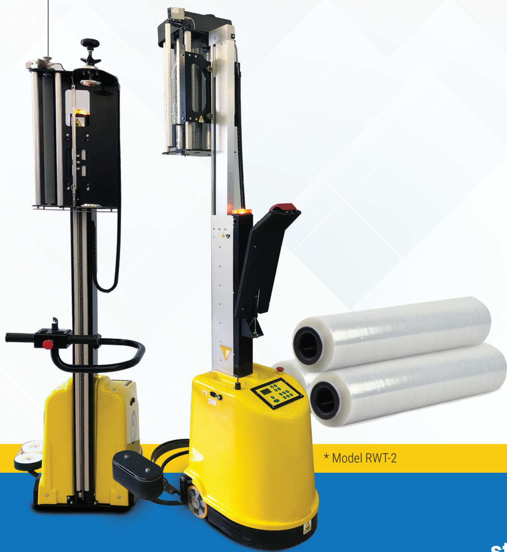
* Model RWT-2