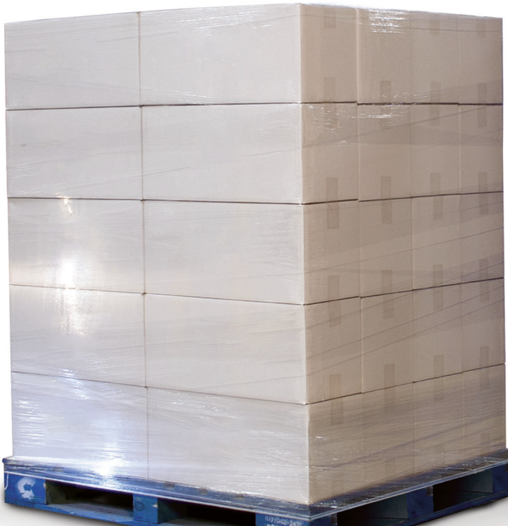
* Model RWSP-3