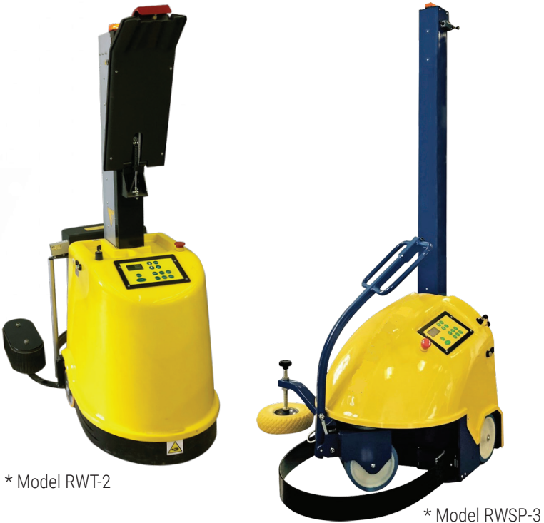
* Model RWT-2