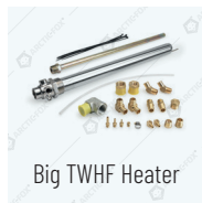
Big TWHF Heater