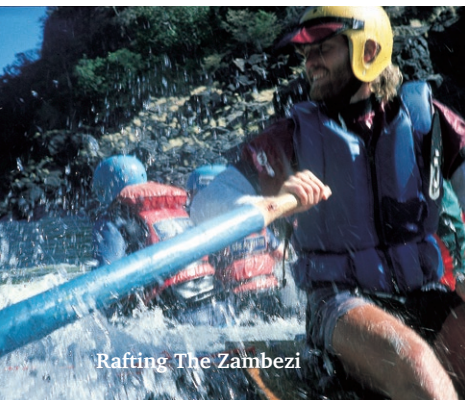
Rafting The Zambezi