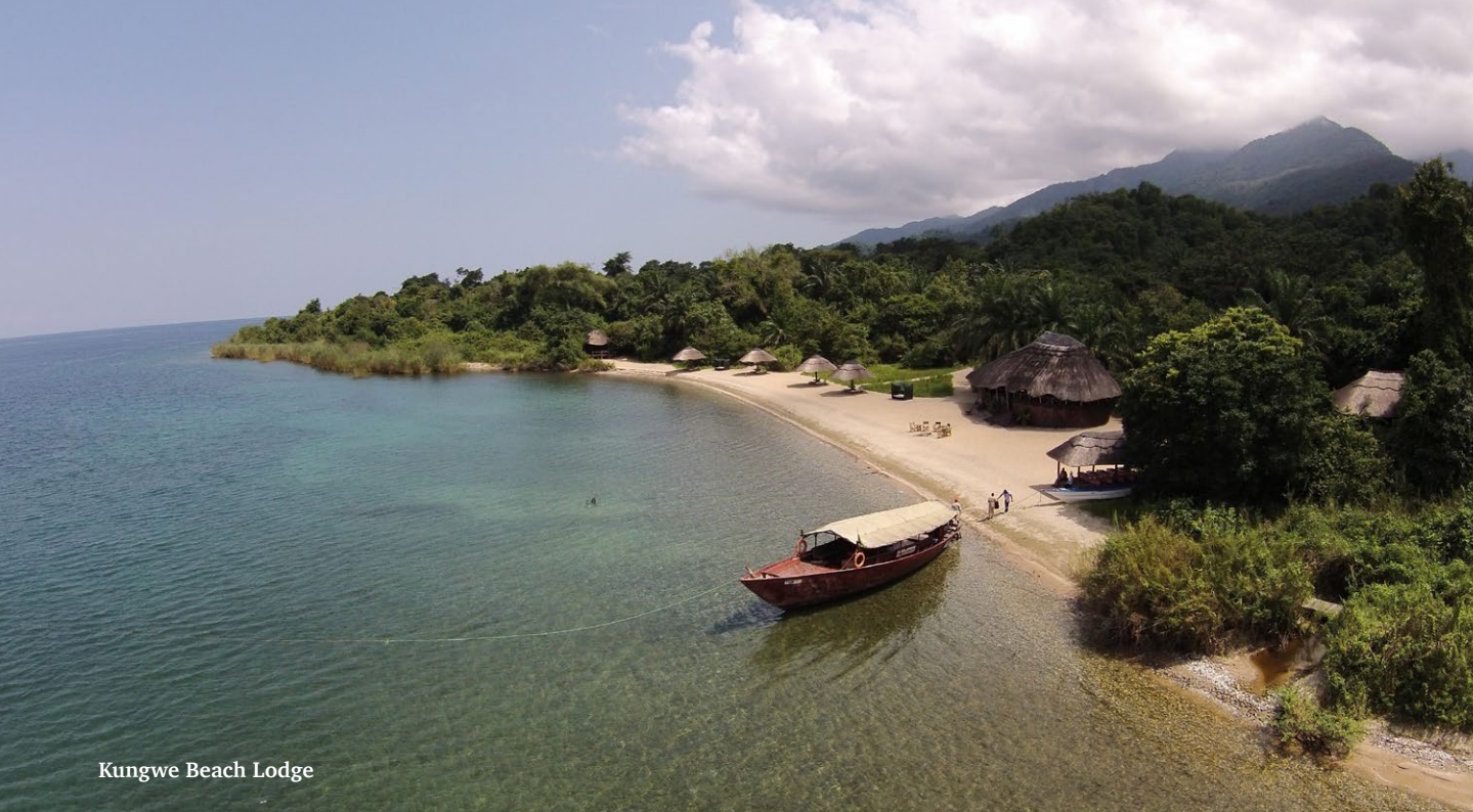
Kungwe Beach Lodge