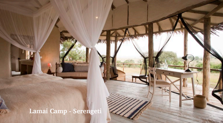
Lamai Camp - Serengeti