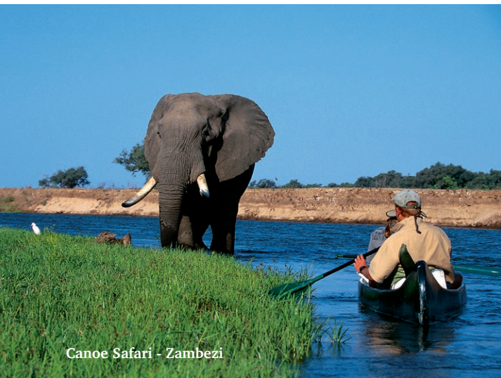
Canoe Safari - Zambezi