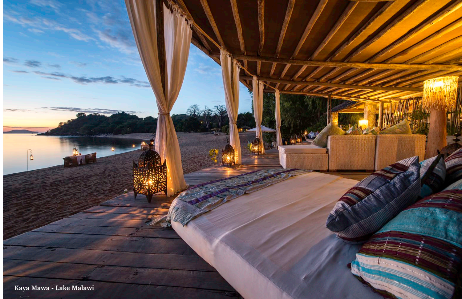
Kaya Mawa - Lake Malawi