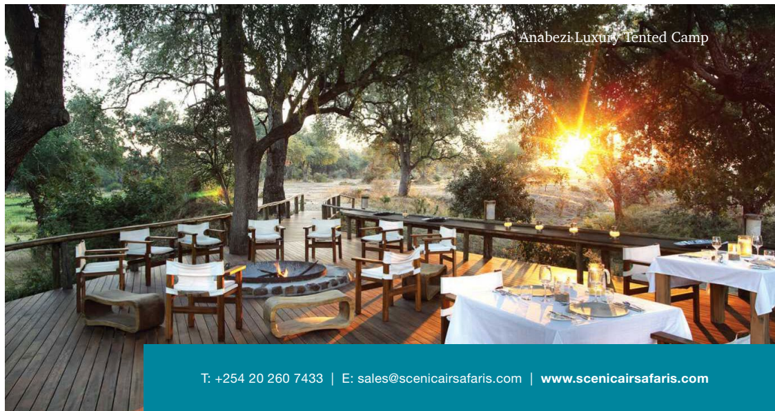
Anabezi Luxury Tented Camp

Itinerary is an example of what is possible within a certain time frame. Sequences of destinations and properties may be changed