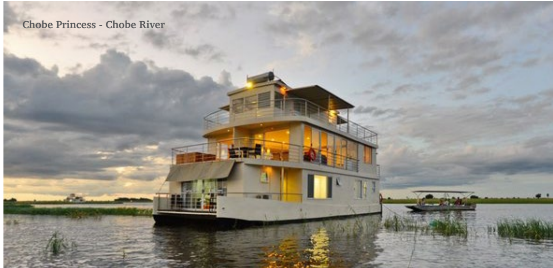
Chobe Princess - Chobe River

Itinerary is an example of what is possible within a certain time frame. Sequences of destinations and properties may be changed