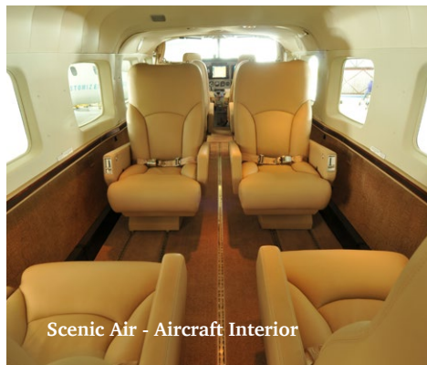
Scenic Air - Aircraft Interior