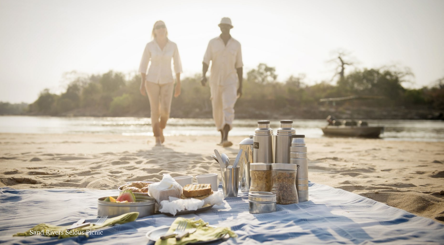
Sand Rivers Selous Picnic