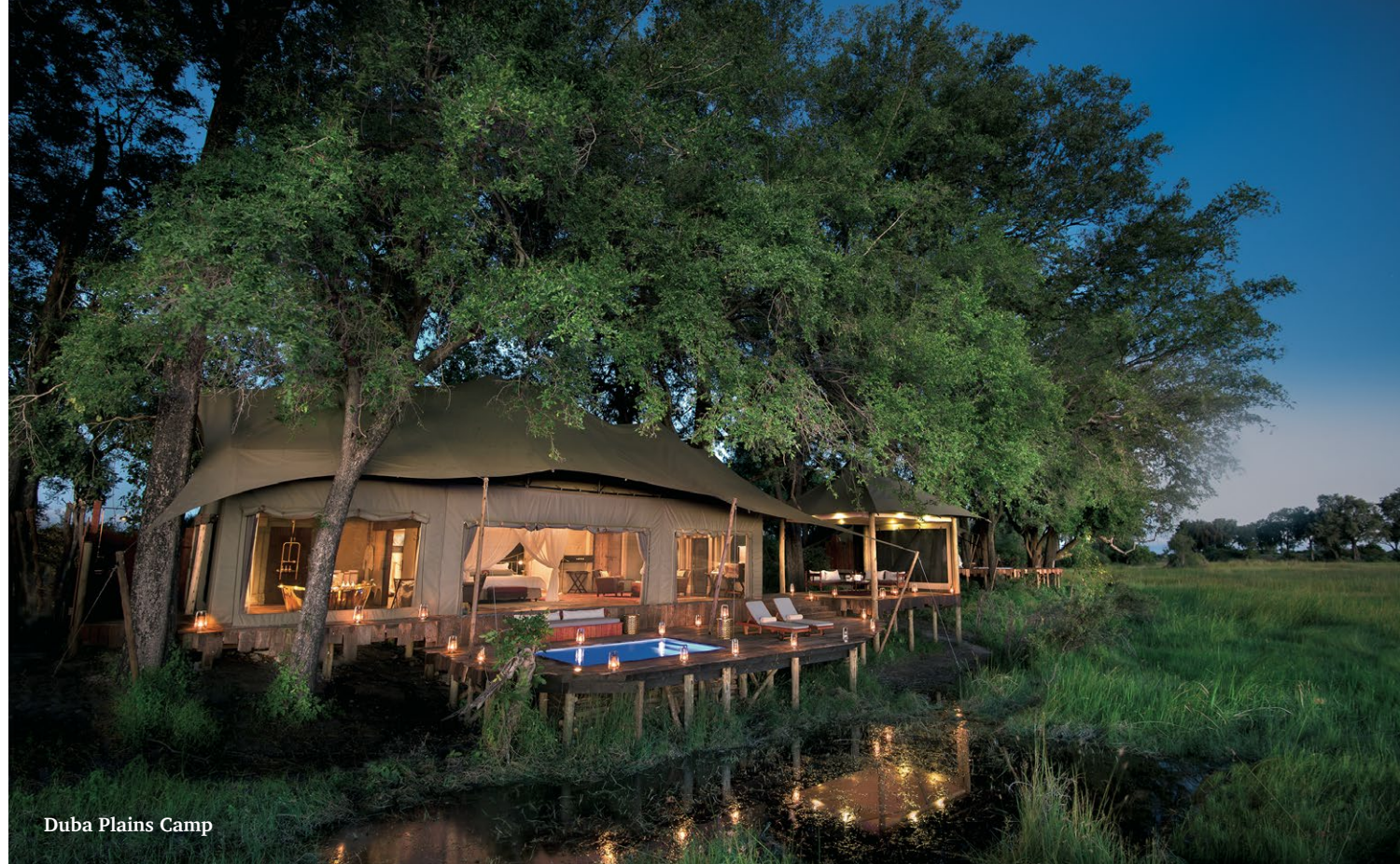
Duba Plains Camp