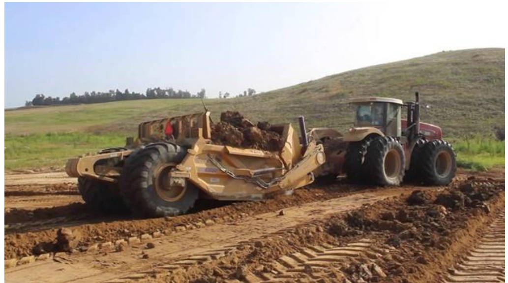
Tractor and Pan performing work

This is just one example of better ways to accomplish the same goal, all while reducing long term environmental harm.