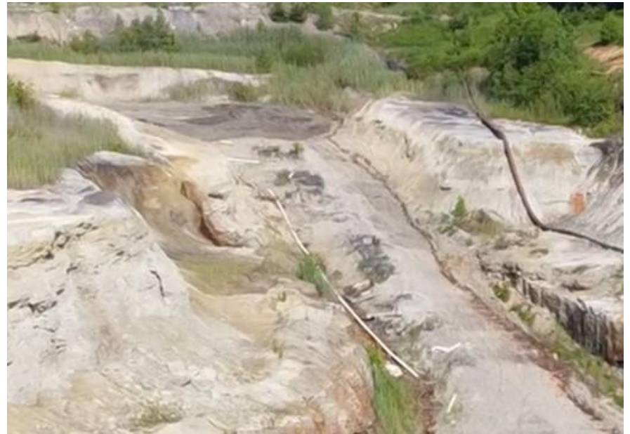
Infrastructure removed from pit slope to prepare for re-grading