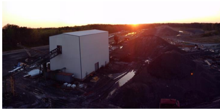
Improperly stored waste material