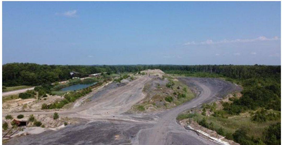
Permitted refuse storage area