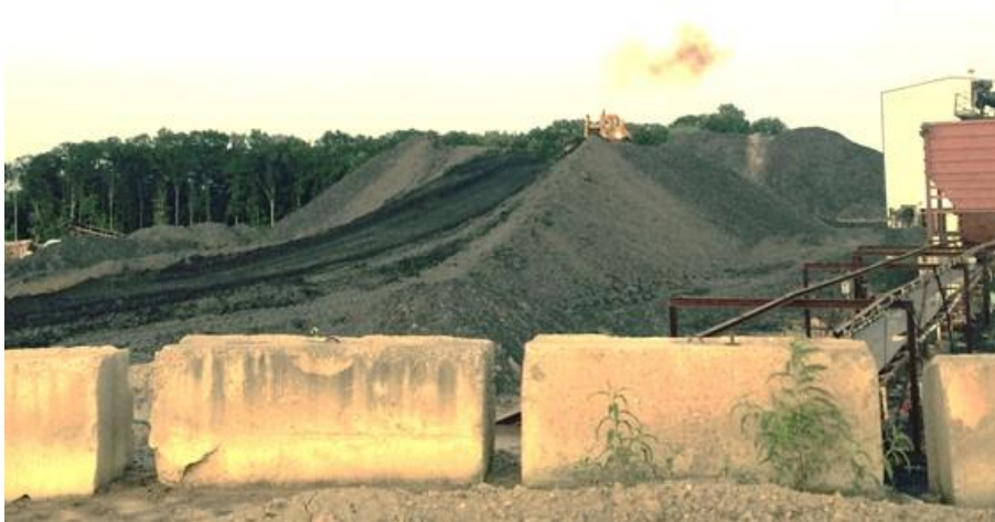
Improperly stored refuse material first being moved by us