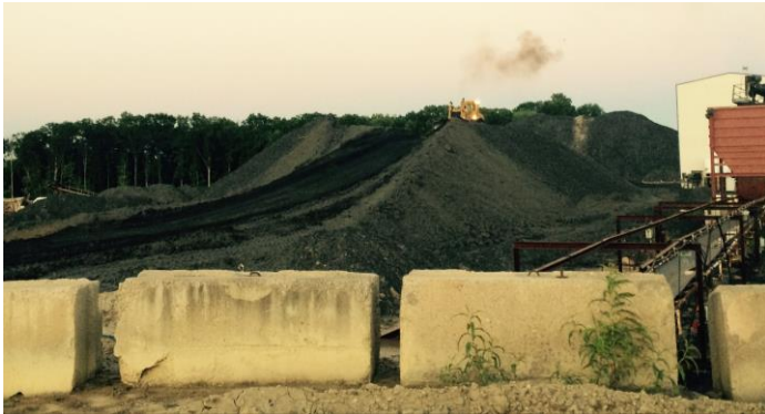
Improperly stored waste material

Instead, our solution was utilizing a highly modern, fuel-efficient tractor and pan solution. Given Platinum was falling on tough times and wouldn’t pay for it, we utilized our own funds to acquire a very modern, $500,000 tractor and pan that did the job of five pieces of equipment with a 1/6th to 1/8th of the fuel consumption. Since the tractor and pan has been acquired it has run continuously with minimal break downs and has literally moved mountains!