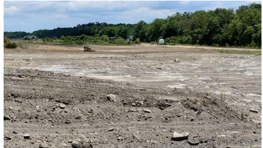
All junk and scrap nearly removed and cleaned up.