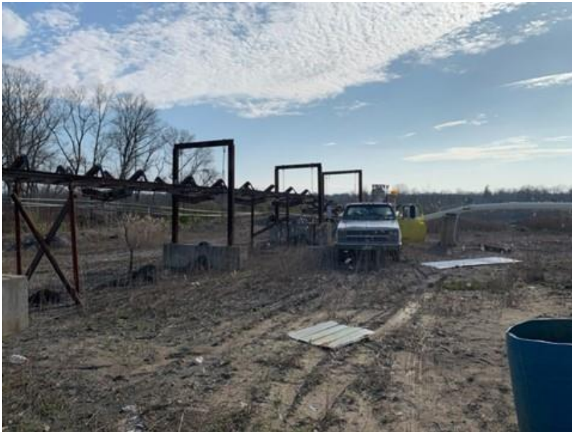
Rusting infrastructure left in-place

To begin the process of placing excavated material back into the mine pit as these alternatives were evaluated, we removed all slope infrastructure, head drives and other equipment and infrastructure that was present on the slope itself. This resulted in over 300 foot of belt, structure and head drives removed. A few pieces of deep mine equipment and underground infrastructure remains in the deep mine itself as the situation is evaluated.