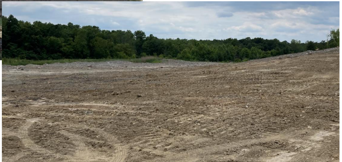
Ponds that are subsequently "filled in and cleaned up."