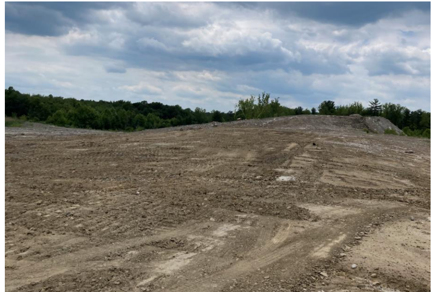
All three mountains of waste material now properly stored