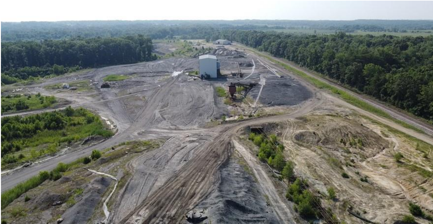
Site preparation for future mining or community enjoyment

In either case, the community and the environment are in a significantly better position as a result of our actions at the site.