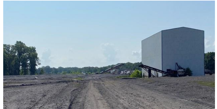
Waste material moved to it's proper storage location.