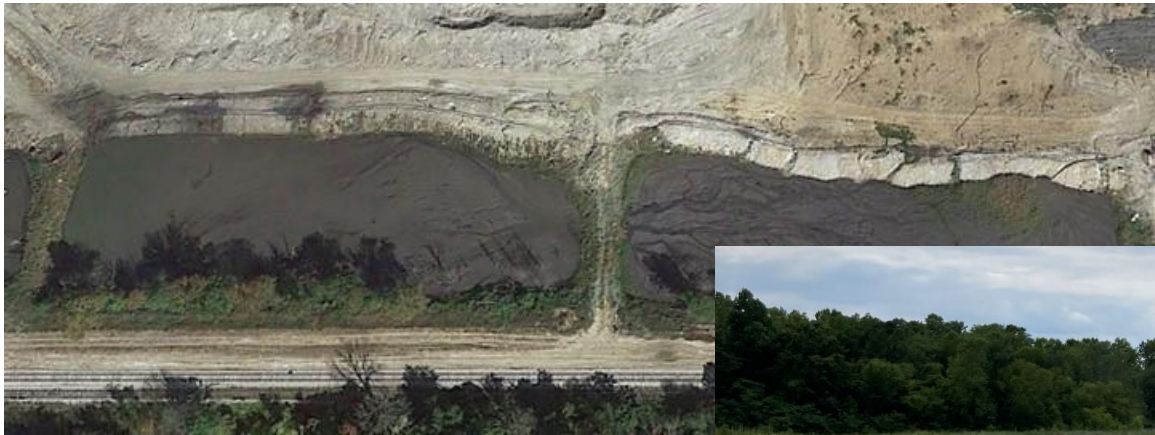
Completely full and out-of-compliance settlement ponds.