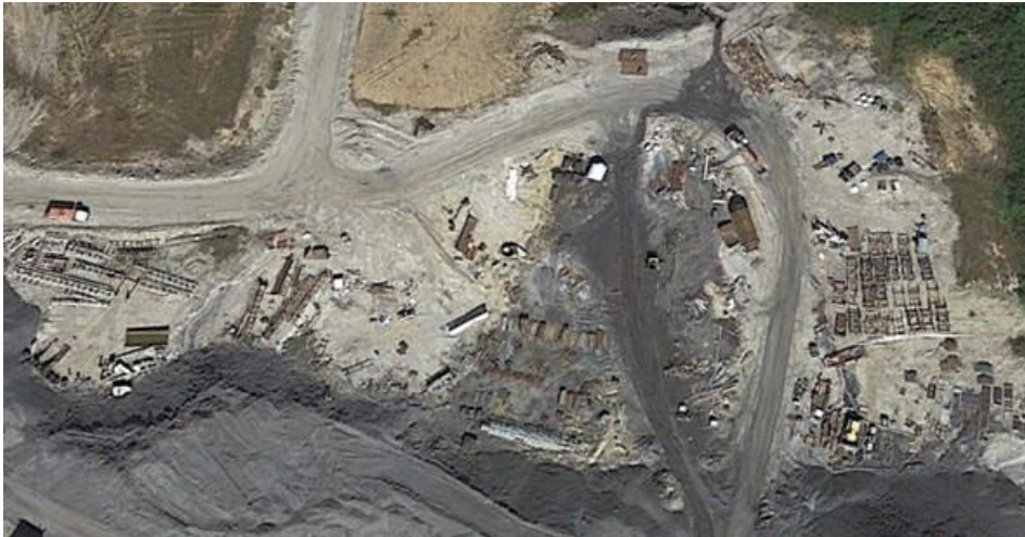
Junk and waste litter the Indiana Fish and Wildlife property