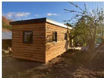
Pump is activated automatically