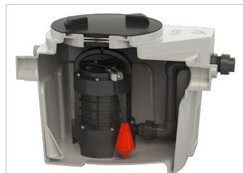
Collects all waste from hut

"We have been living here for just over a month now and the pump seems to be working really well. It's a seamless system, thanks for all your help. Really appreciate what you did for us sorting it out."