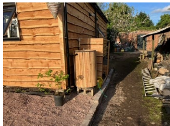
Sits discreetly underground