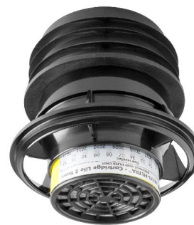
Carbon Filter (Cover removed)

The full kit also includes a tank adaptor to allow a tight seal when fitting the odour trap. To connect 4" waste pipework into the tank, we also recommend our WC-Connector Kit .