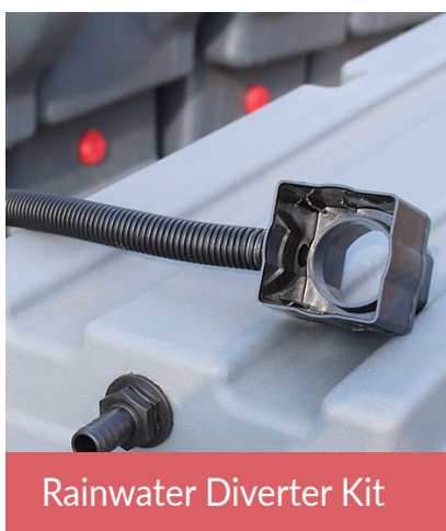
Rainwater Diverter Kit