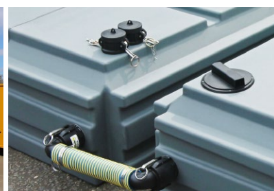
Flat Tank 160 Linking Kit