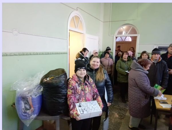
Bibles and blankets being distributed in Zaporizhzhia this week