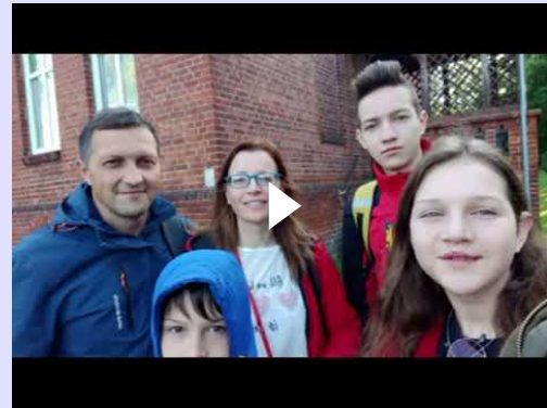
The Prokopenko family's Story

They were kind enough to film this video during their journey, and allow us to share it with you.