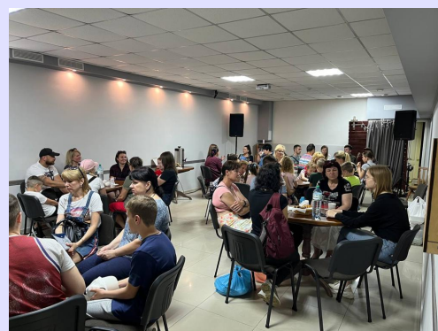
Baptismal classes at the church in Uman (see below), for people who turned to Christ since the start of the war.

But here, as in other parts of Ukraine, many people are more open to the Gospel than ever before. (The church in Uman recently sent us this picture of baptismal classes in the church).