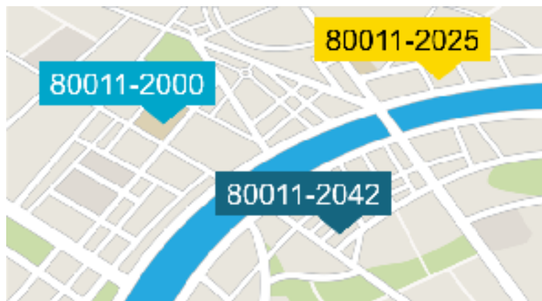
Graphic 3: TransUnion provides insights at the Zip+4 and other geographic levels

TransUnion aggregates multiple data sources to provide a summary of attributes at both the individual and community level to enable you to get a complete picture of your patients' health to tailor interventions to meet their needs and address unique community challenges.