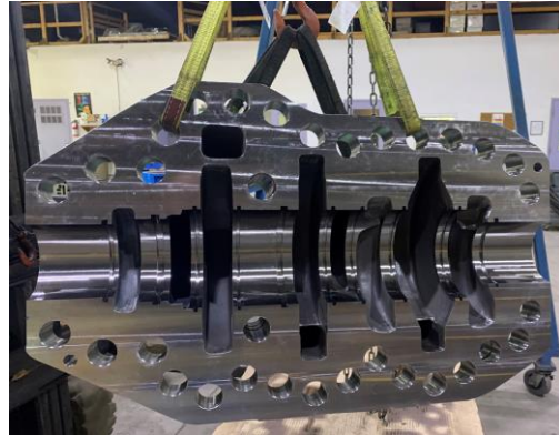
CASING TOP MACHINED