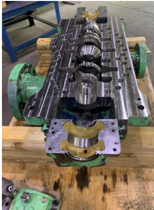
CASING BOTTOM MACHINED, RINGS INSERTED