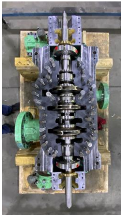
RECONDITIONED ELEMENT IN CASING