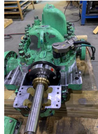
TORQUE OF NUTS