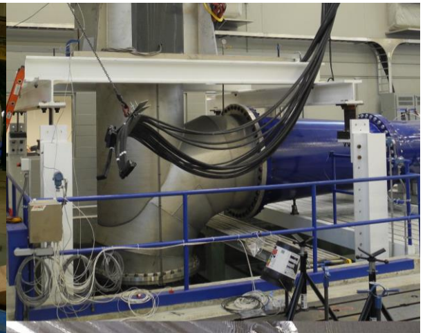
PUMP AT TESTING FACILITY