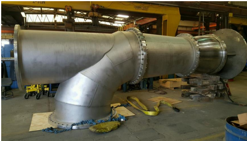
PUMP ASSEMBLED AND READY FOR TESTING