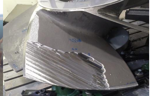
5-AXIS MACHINING OF IMPELLER