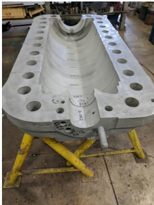
Top Half Sample

Emnor Makes Casing, Bearing Housings and Stuffing Box for 1950's Feed Water Pump