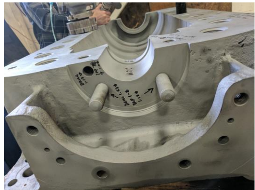
Bottom Half Sample