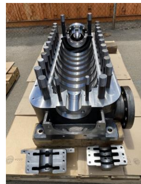
New Bottom Half, Stuffing Box and Bearing Housing