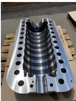
New Top Half