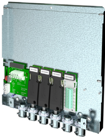
Two-component approach allows GATEWAY Enclosure to be installed and electrical connections terminated separate from the the GATEWAY Head

This unique “two-component” approach allows an Enclosure to be installed and electrical connections terminated by electrical contractors separate from the installation of the GATEWAY Head, which may be installed by a technician with no electrical accreditation.