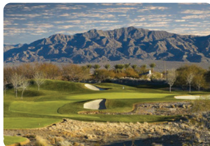
TCP at Summerlin