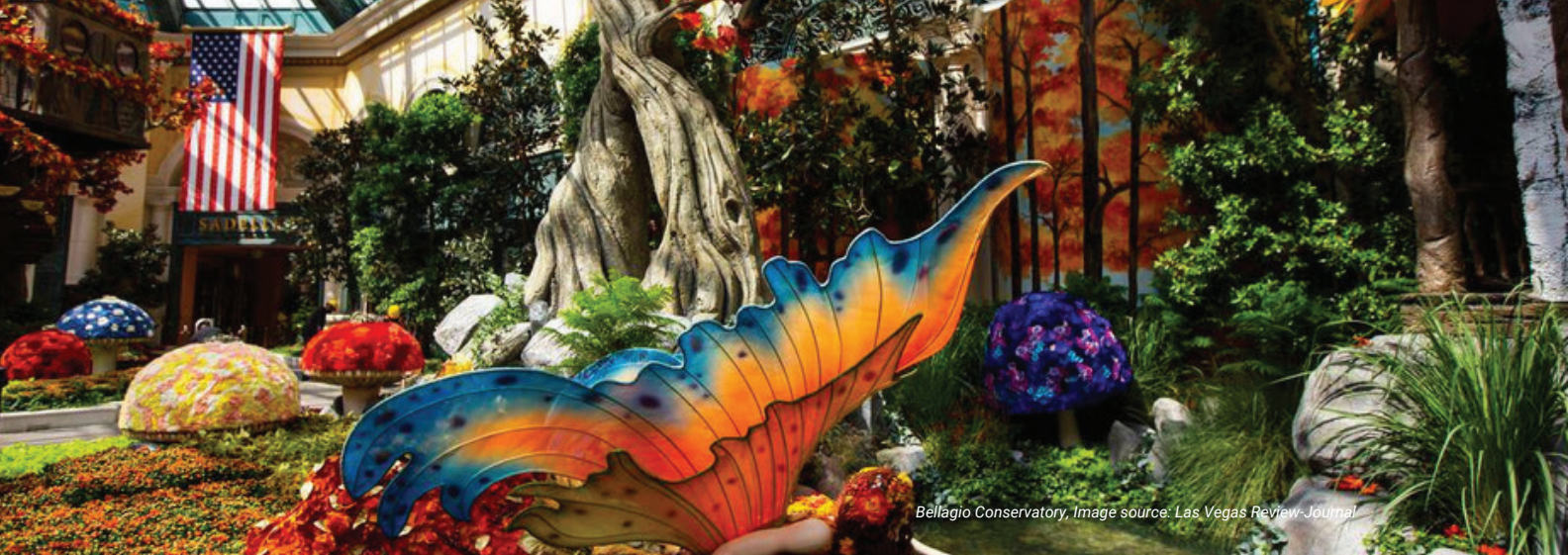
Bellagio Conservatory