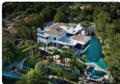
Spanish Trail Country Club

(702) 256-0111 1700 Village Center Drive Las Vegas, NV 89134 Number of holes: 18