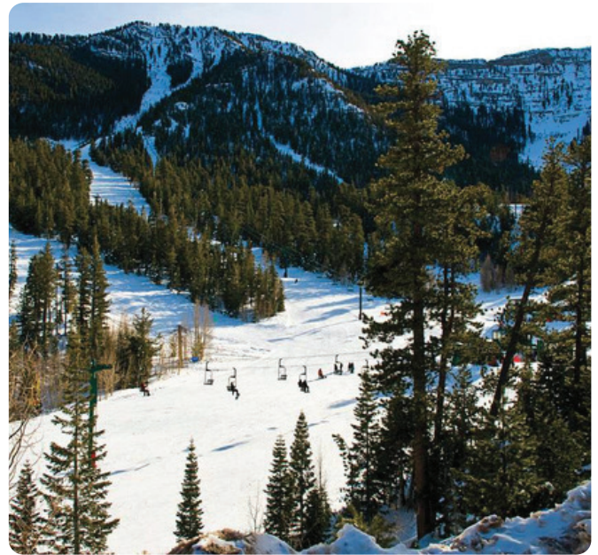
Lee Canyon Ski Resort

The designated trails range from 0.5 to 1.25 miles. Short desert hikes lead to places you will never see from a boat or car. One such place is colorful sandstone formations near the Red Stone Picnic Area along Northshore Road. Another is a canyon where an Indian petroglyph was carved in a rock wall hundreds of years ago.