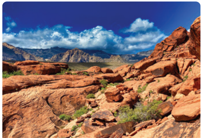
Red Rock Canyon