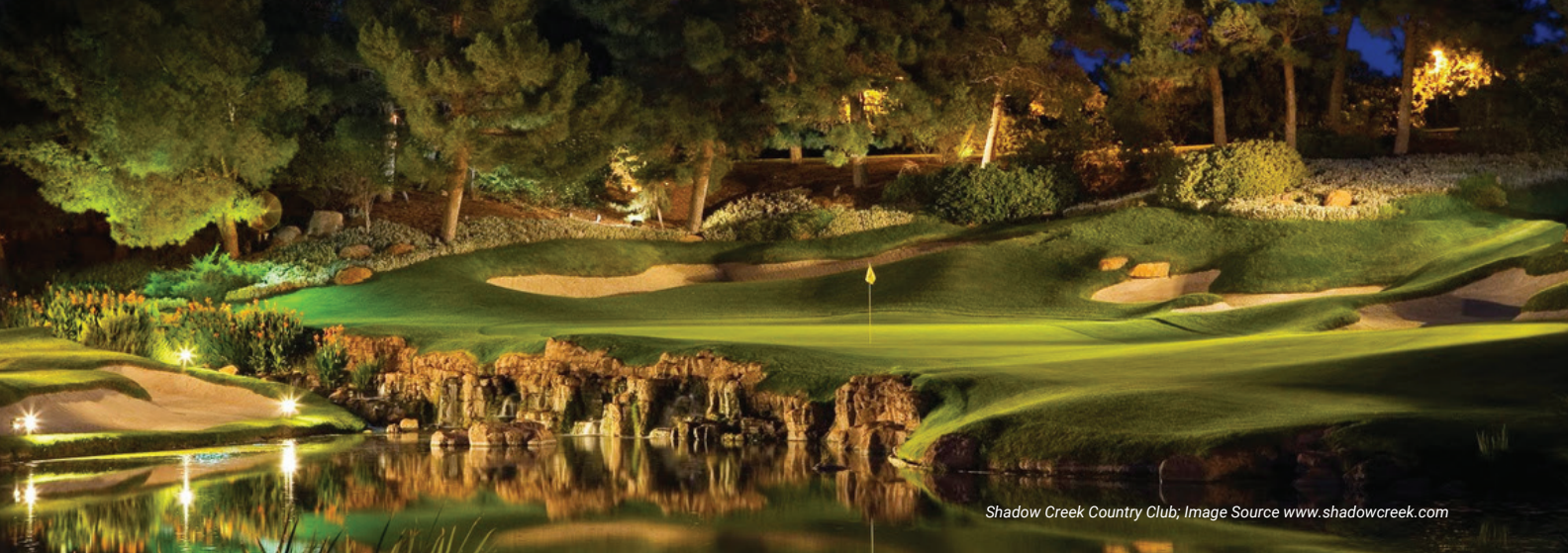
Shadow Creek Country Club; Image Source www.shadowcreek.com