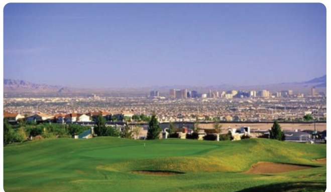
Rio Secco Golf Club