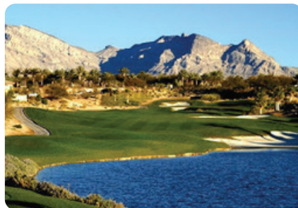
Red Rock Country Club