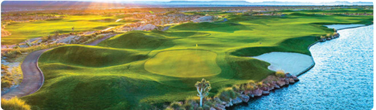
Las Vegas Paiute Resort

(866) 252-4653 401 Paradise Pkwy Mesquite, NV 89024 Number of holes: 18