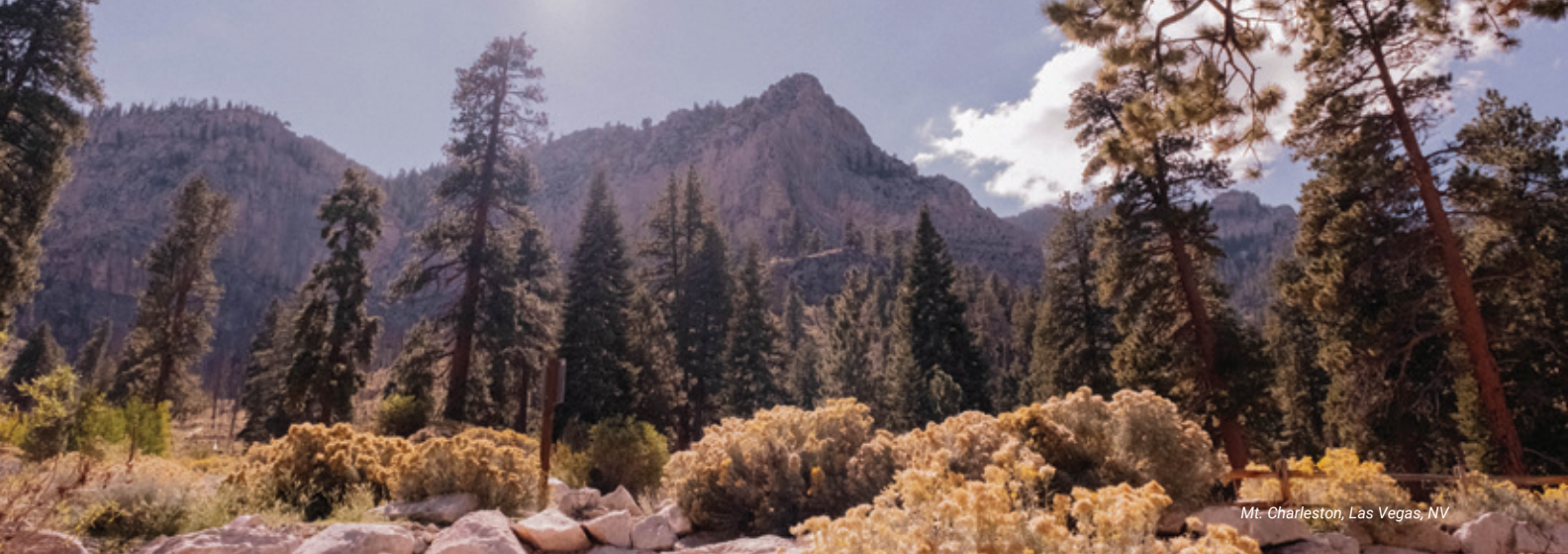
Mt. Charleston, Las Vegas, NV