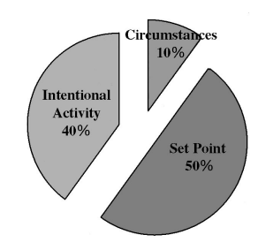
Figure 1. Three primary factors influencing the chronic happiness level.

proximate percentage of the variance that each of the three factors accounts for in cross-sectional well-being, as suggested by past research. As can be seen in the pie chart, existing evidence suggests that genetics account for approximately 50% of the population variation (Braungart et al., 1992; Lykken & Tellegen, 1996; Tellegen et al., 1988), and circumstances account for approximately 10% (Argyle, 1999; Diener et al., 1999). This leaves as much as 40% of the variance for intentional activity, supporting our proposal that volitional efforts offer a promising possible route to longitudinal increases in happiness. In other words, changing one's intentional activities may provide a happiness-boosting potential that is at least as large as, and probably much larger than, changing one's circumstances. In the following, we provide a definition of each factor, briefly consider whether and how changing that factor can lead to changes in people's chronic well-being, and discuss whether such changes may be sustainable over the long term, that is, whether the forces of hedonic adaptation can be counteracted by that factor.