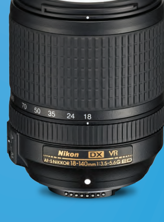
AF-S DX NIKKOR 18-140mm f/3.5-5.6G ED VR lens with purchase of any Nikon DSLR.