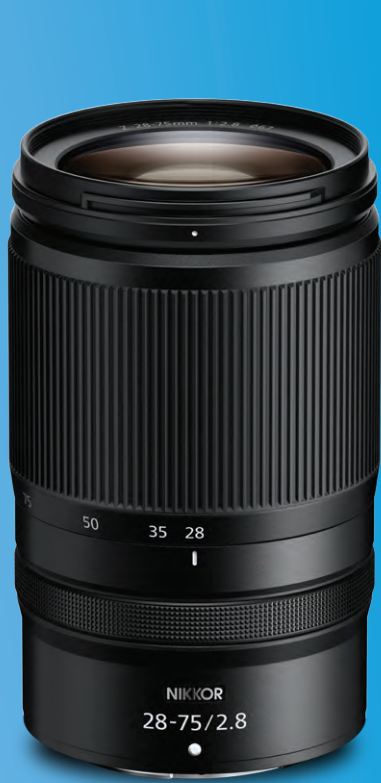
NIKKOR Z 28-75mm f/2.8