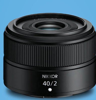
NIKKOR Z 40mm f/2