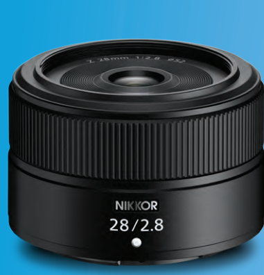
NIKKOR Z 28mm f/2.8