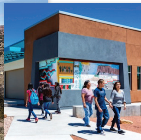
Zuni Youth Enrichment Project headquarters