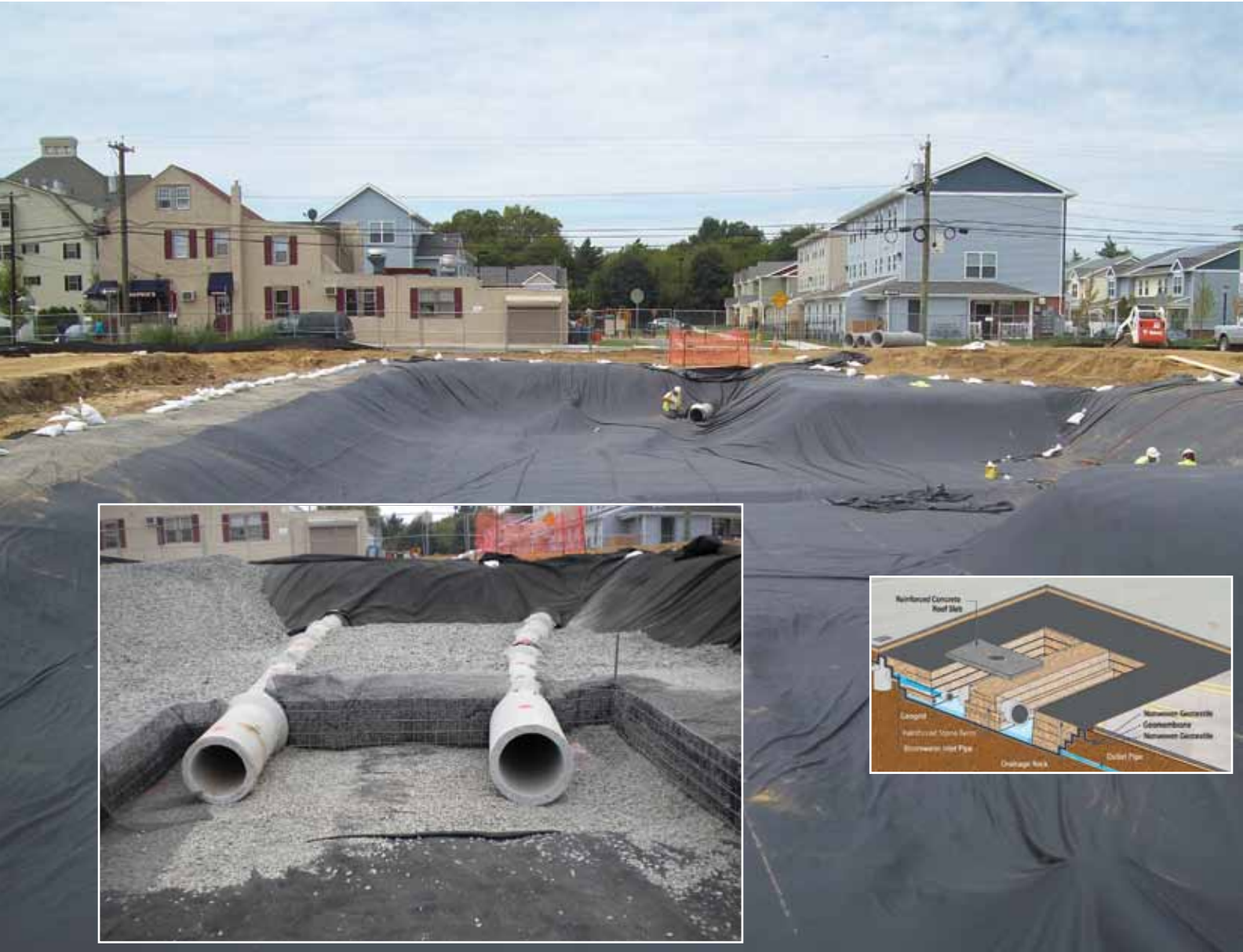
PVC geomembrane installation over underground chamber. Inset: Perimeter wall construction at pipe penetration. Schematic of patented geosynthetic based underground stormwater detention system.

R oosevelt Manor sits in the heart of Camden, New Jersey's Centerville neighborhood across the Delaware River from Philadelphia. Built in the