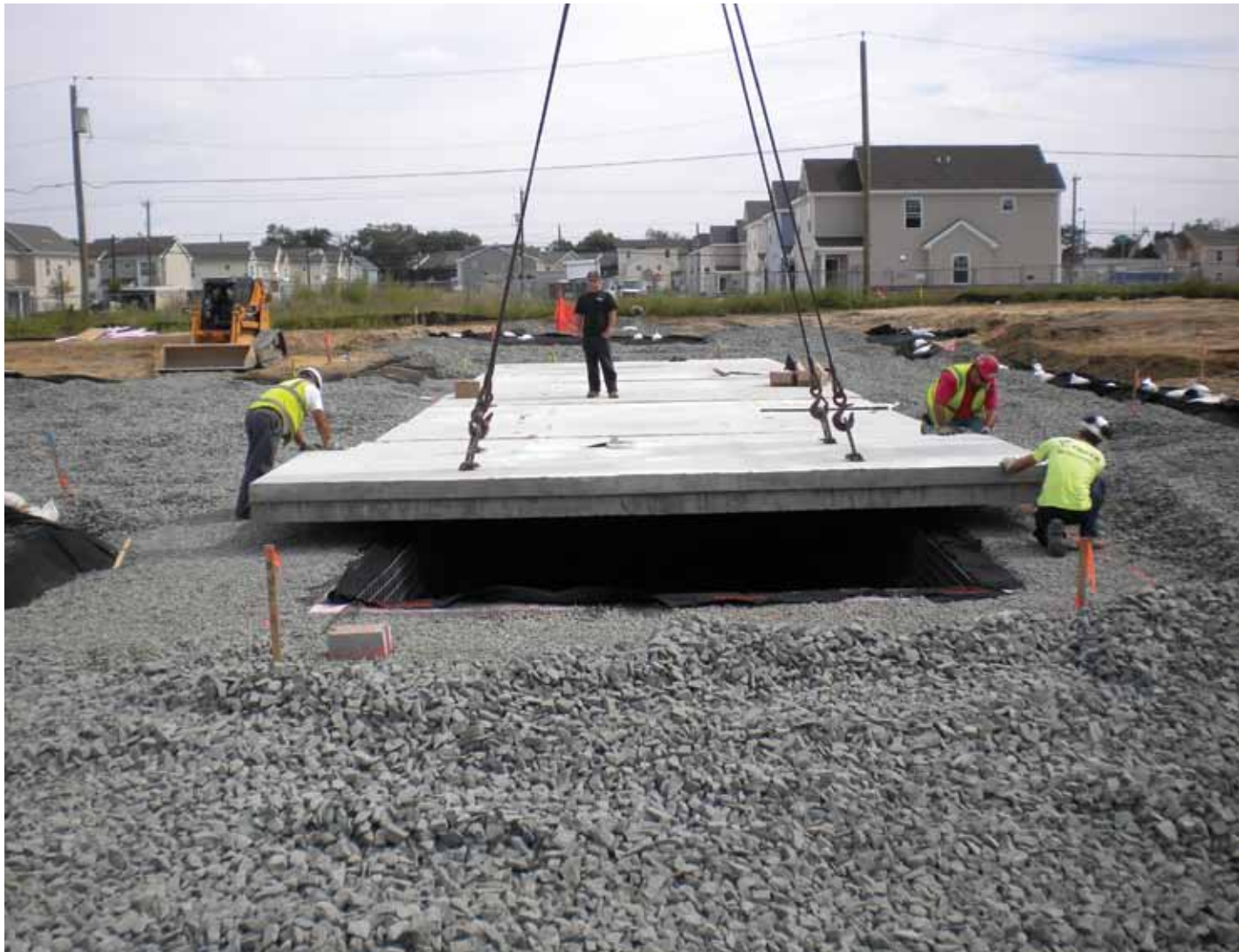
Stormwater detention system roof installation over chamber.

and also provides additional storage capacity. On larger projects an interior pier built in the same manner as the perimeter walls can expand the size of the chamber by supporting the concrete roof panels. At the wall face, the geosynthetic reinforcement is wrapped to retain the stone backfill and welded wire forms are utilized to enable compaction. Inlet and outlet pipes extend through the perimeter liner system and the geosynthetic wrapped stone wall face into the open chamber. The outlet pipe is typically connected to a downstream manhole with a flow control weir containing orifices that restrict flow for all but the largest storm events. Another important feature of this geosynthetic based system is the large chamber enables access for future sediment inspection and removal, an important consideration for the city's municipal department responsi-