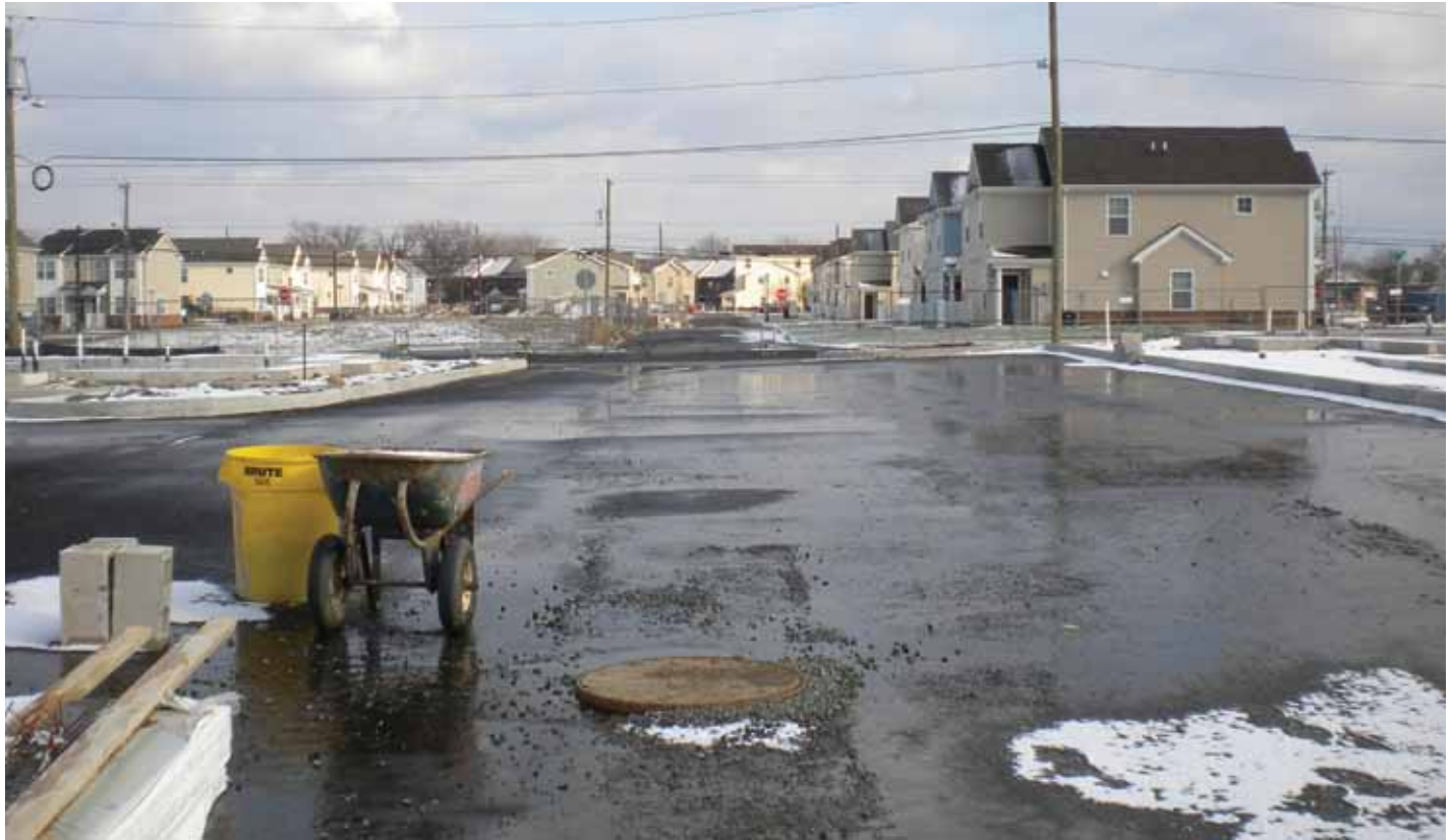
Roosevelt Manor with underground stormwater detention system below the street.

are also located in Roosevelt Manor. In these two systems a stone placement box was added to the operation to create a moving stockpile and reduce the stone waste factor. The Housing Authority of the City of Camden supervised all construction at the site and other city agencies will be responsible for the inspection and maintenance of the stormwater management system.