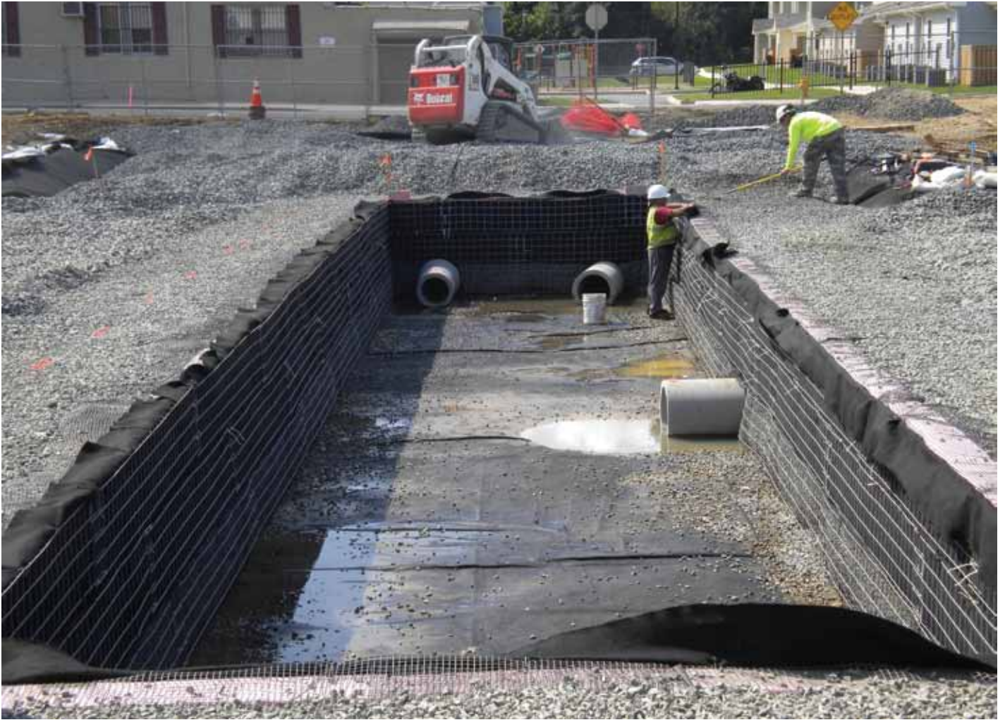
Stone walls are constructed around the perimeter of the lined excavation over the geomembrane and stabilized with geosynthetic reinforcement at tightly spaced lifts.

its doors the four acre development was demolished and with HopeVI funding from the U.S. Department of Housing and Urban Development, Roosevelt Manor was rebuilt.