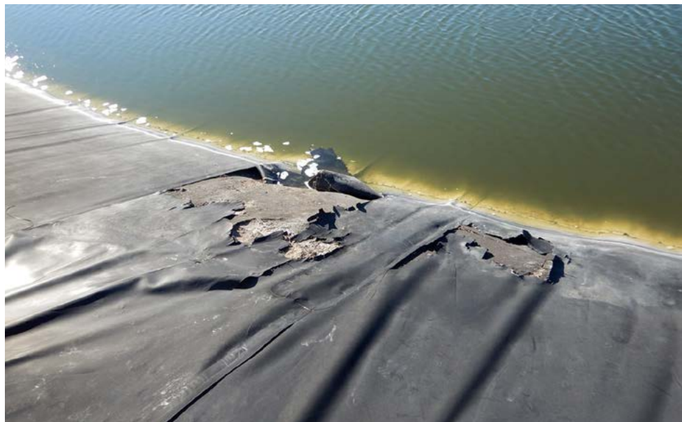
FIGURE 2 Beaver damage to geomembrane liner