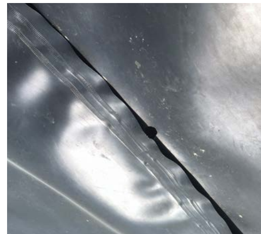
FIGURE 1 Close-up of damage to PVC geomembrane from deer hooves